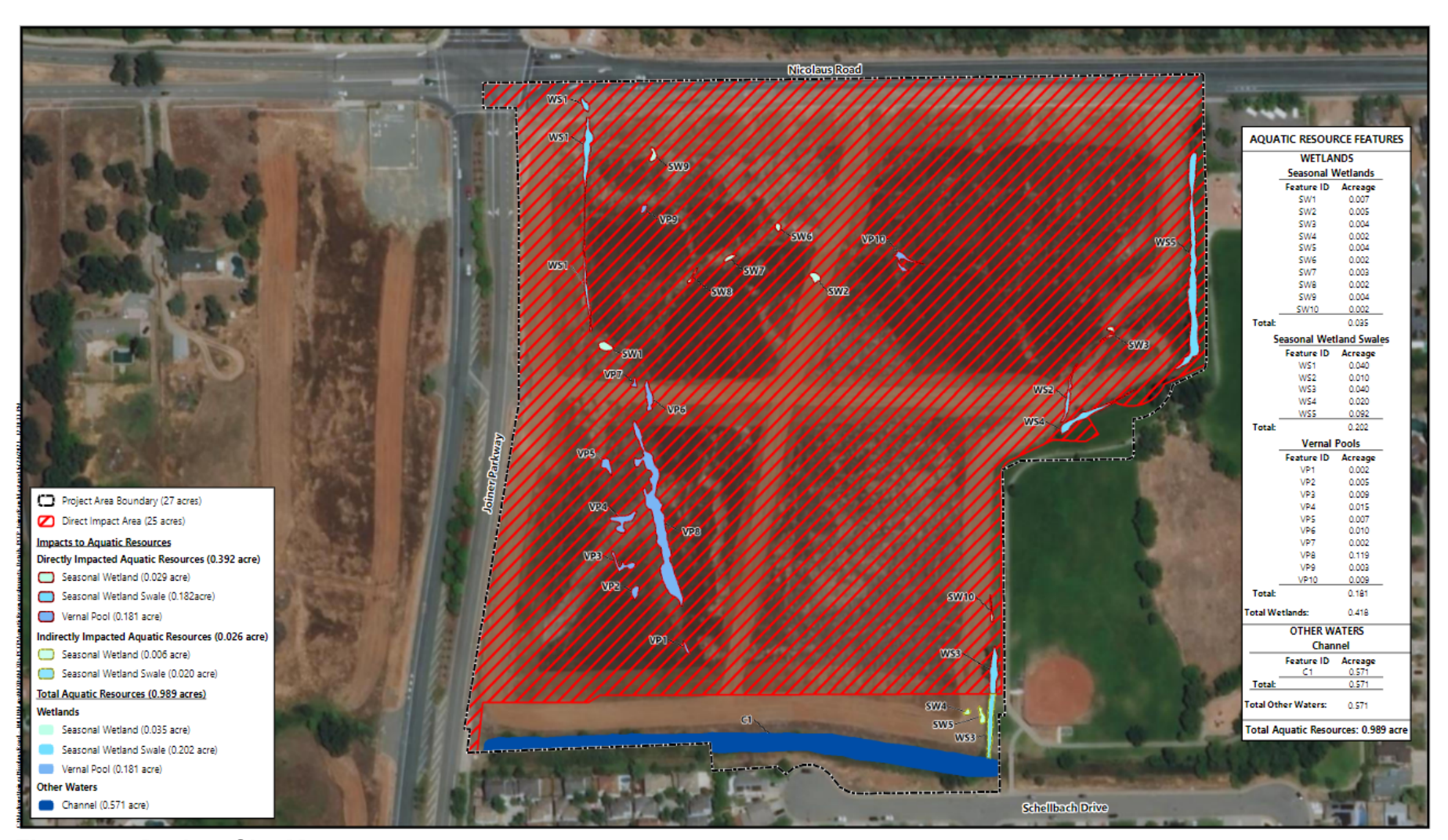
Figure 2 - Project Site Map