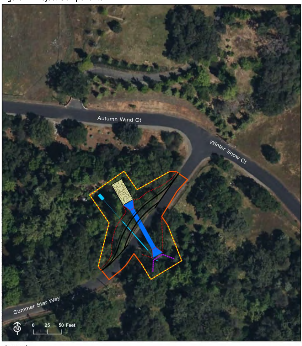
Figure 1: Project Components