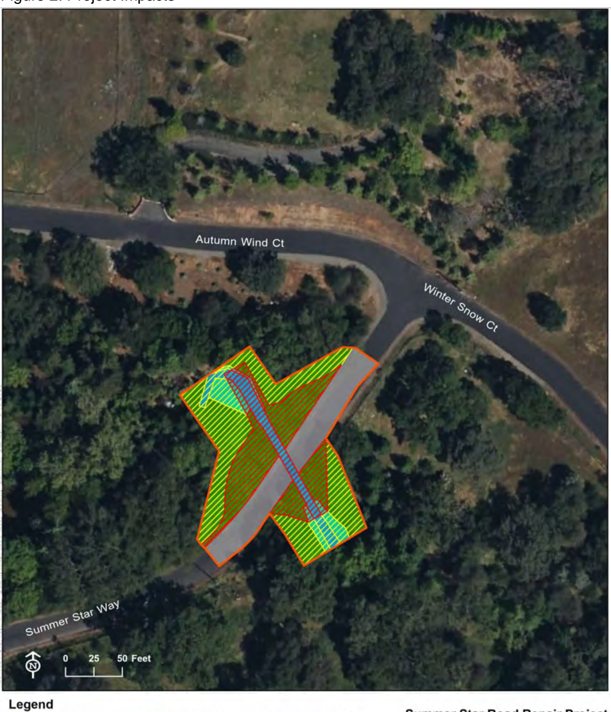
Figure 2: Project Impacts