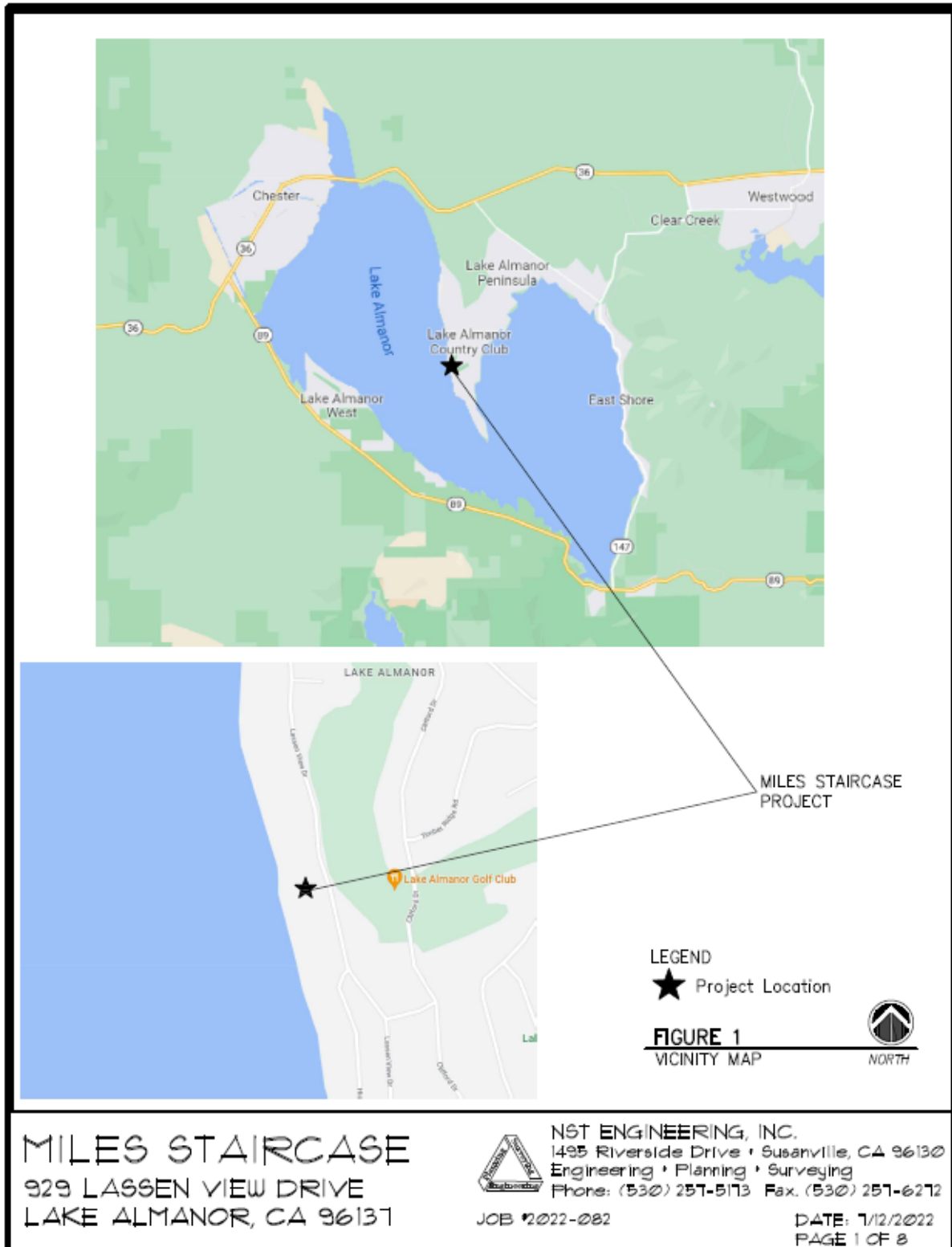
Figure 1: Project Location Map