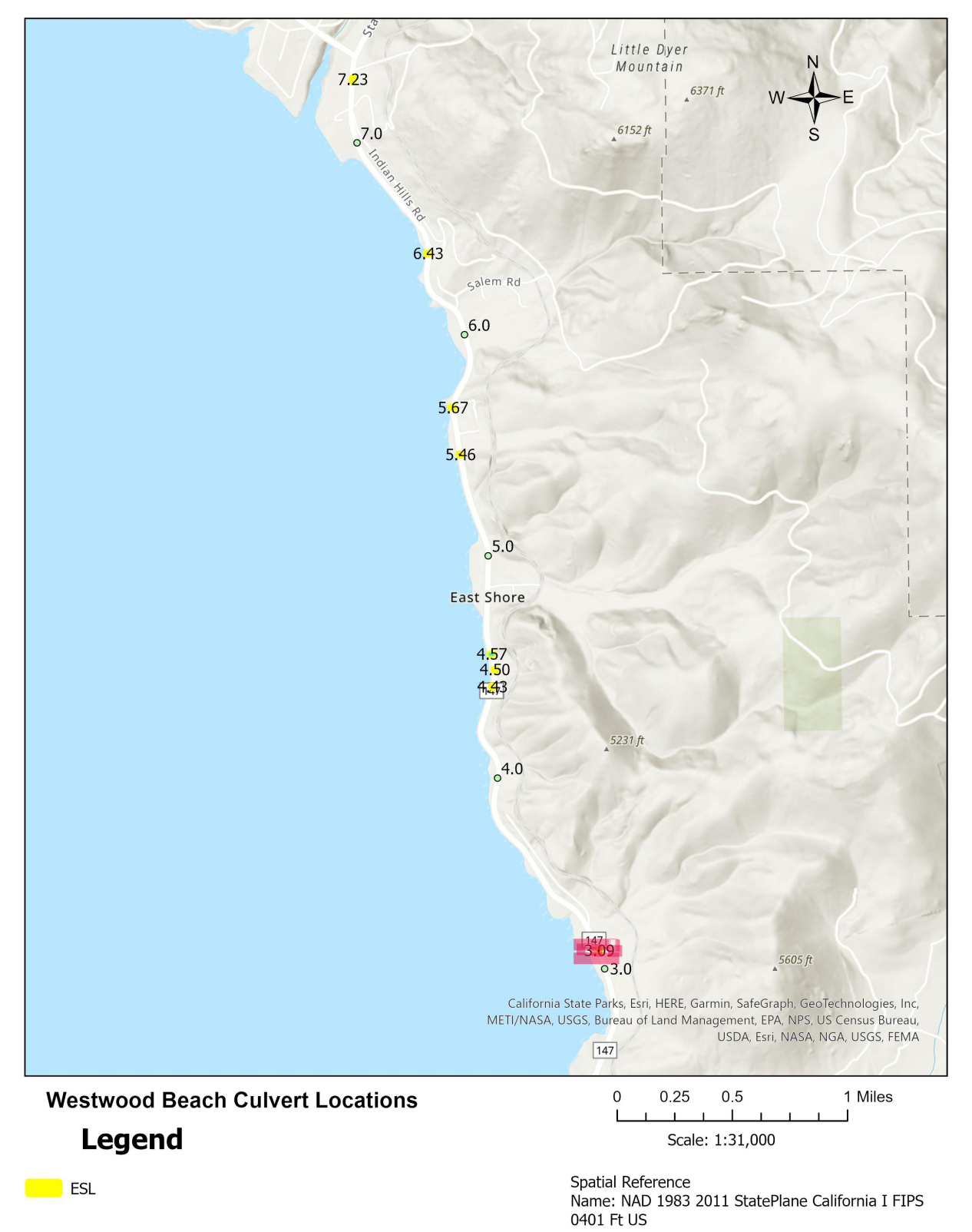
Figure 1. Project Location Map