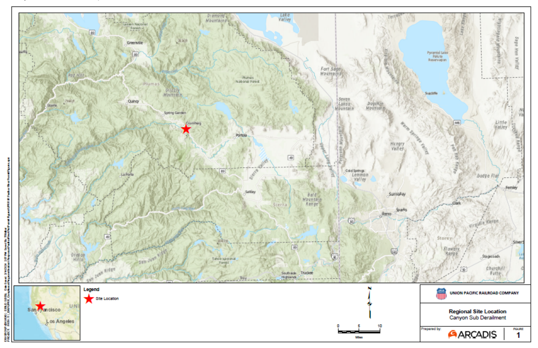
Figure 1: Project Location Map