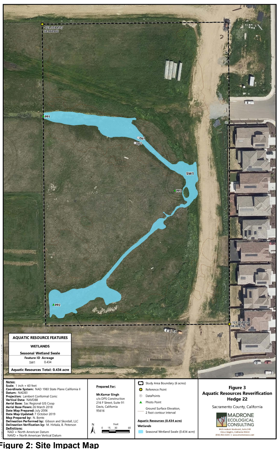
Figure 2: Site Impact Map