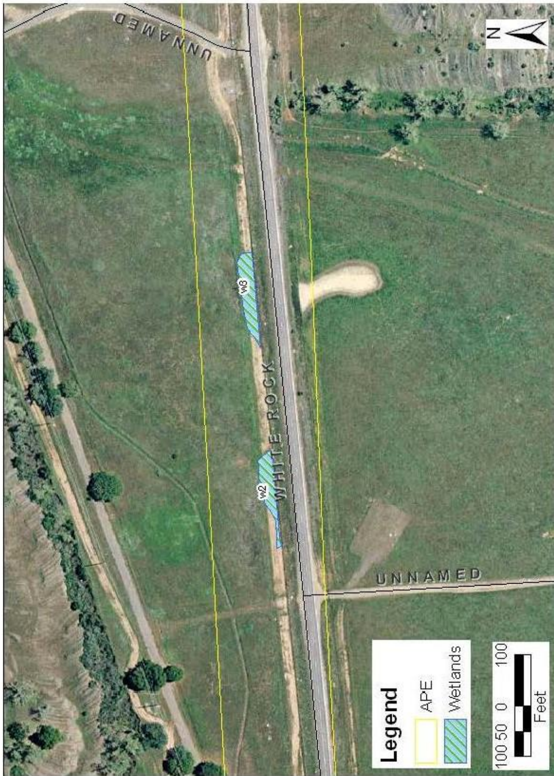
Figure 2 – Impacts to Waters of the State