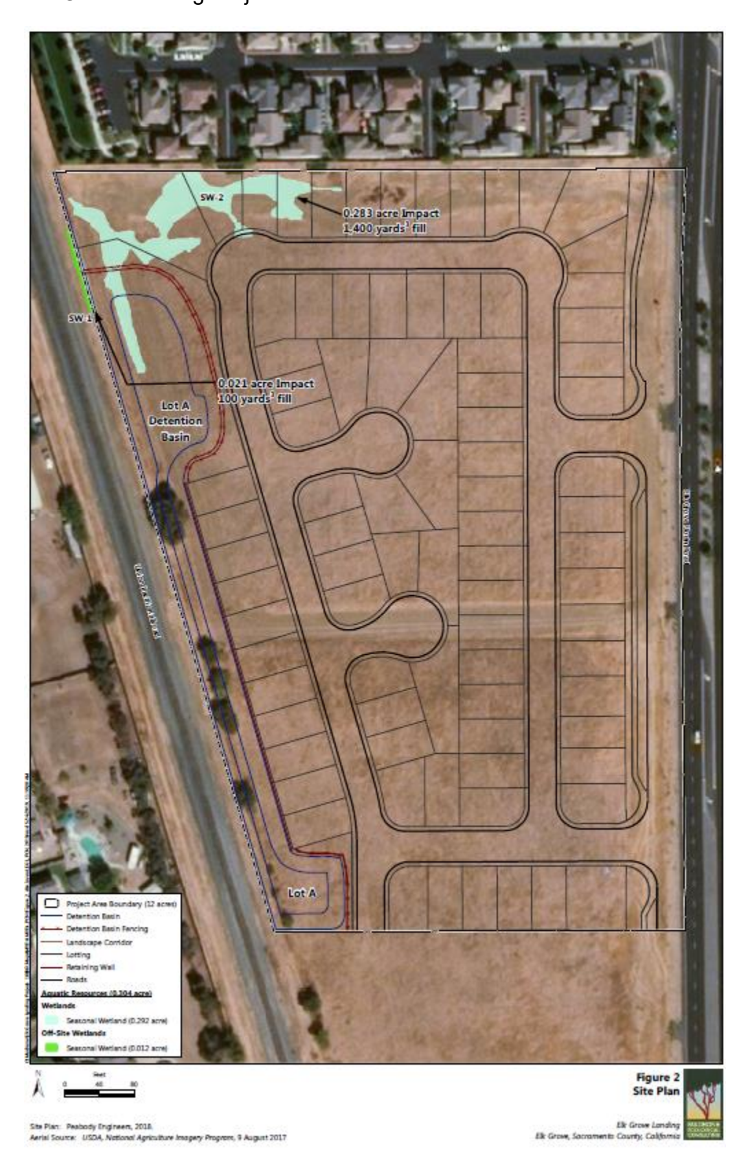
Figure 2 - Site Impact Map