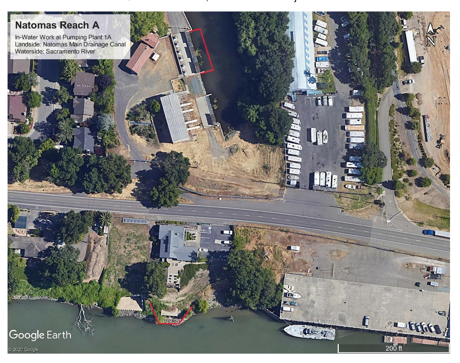
Figure 2 Impacts to Waters of the State