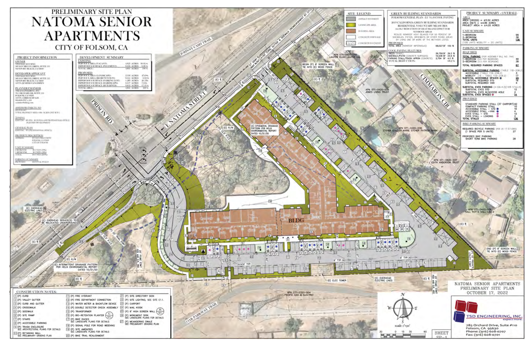
Figure 3: Project Design