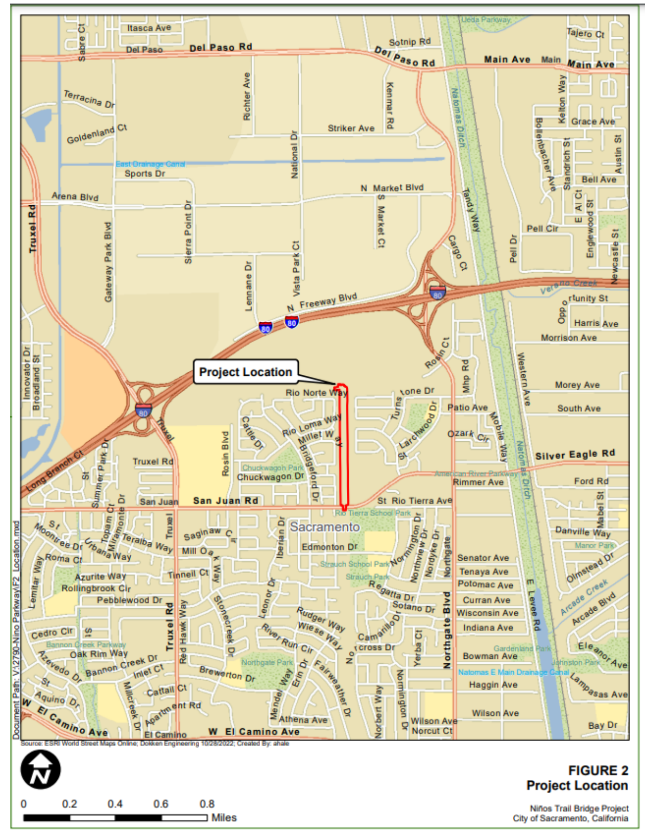
Figure 2: Project Location Map