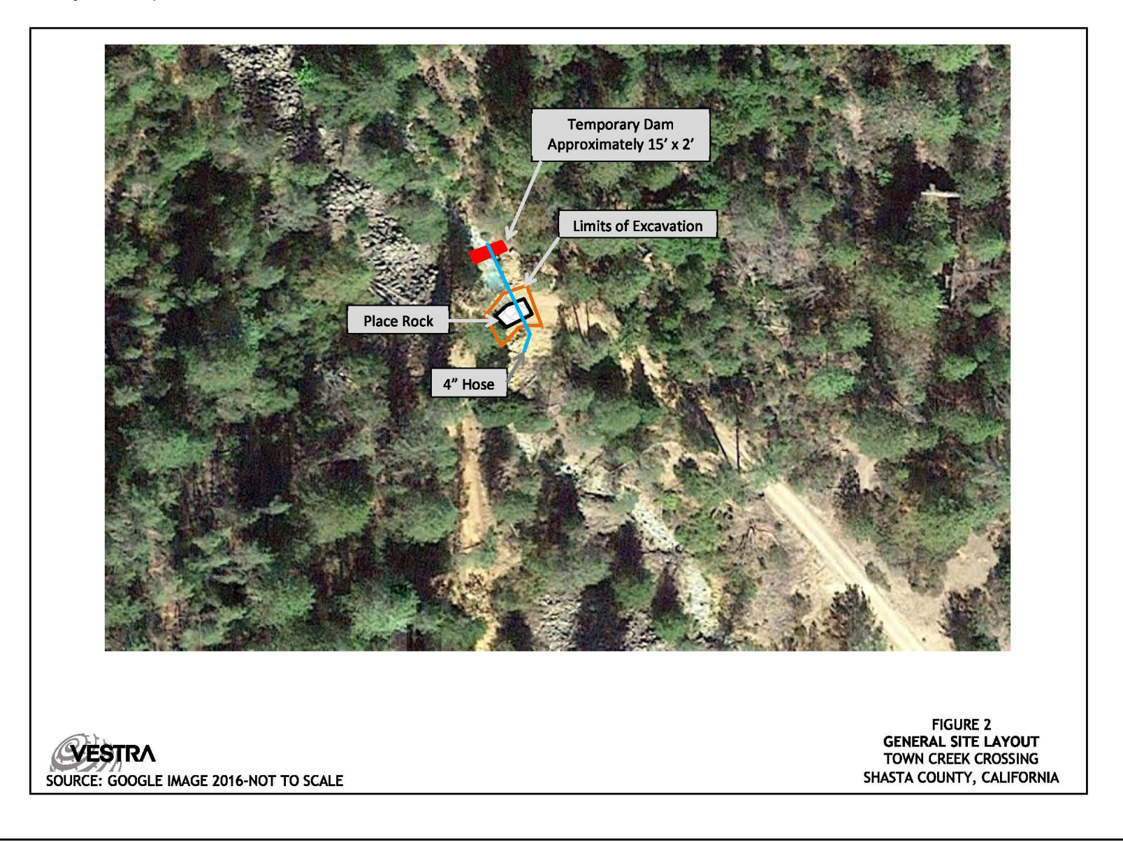
Figure 2. Layout Map