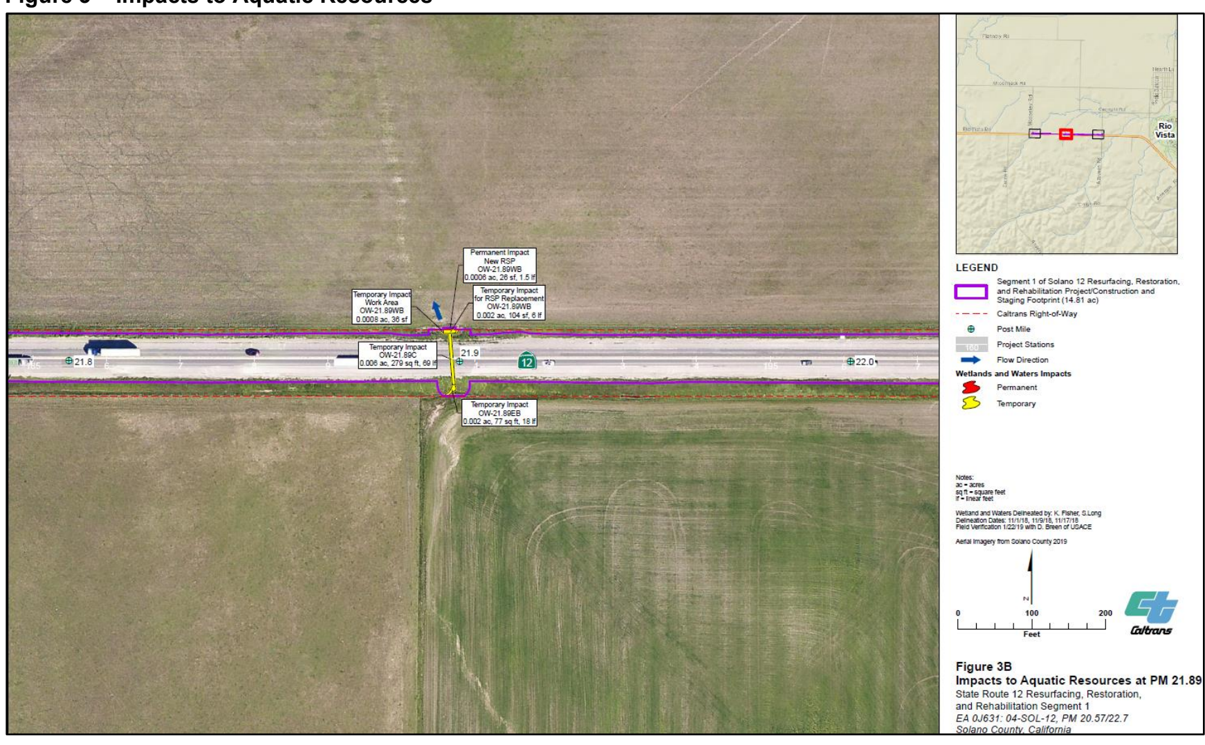
Figure 3 – Impacts to Aquatic Resources

California Department of Transportation - 18 - State Route 12 Resurfacing, Restoration and Rehabilitation Project, Segment 1 (EA-0J631)