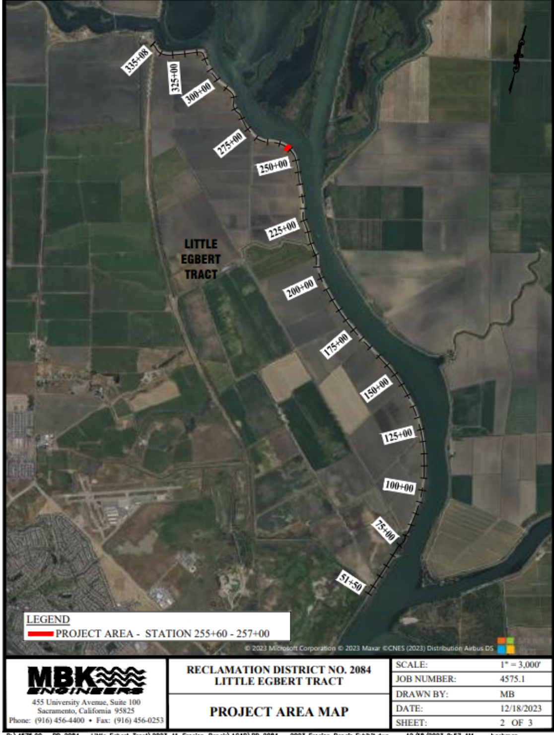
Figure 2: Site Impacts map

R: \4575.00 RD 2084 - Little Egbert Tract\2023-11_Erosion_Repair\ACAD\RD 2084 - 2023 Erosion Repair Exhibit.dwg 12/18/2023 9:57 AM b