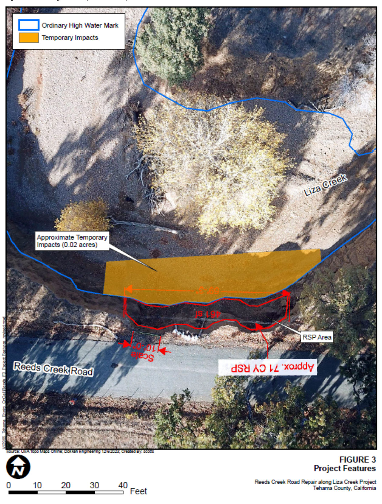
Figure 3: Project Impacts Map