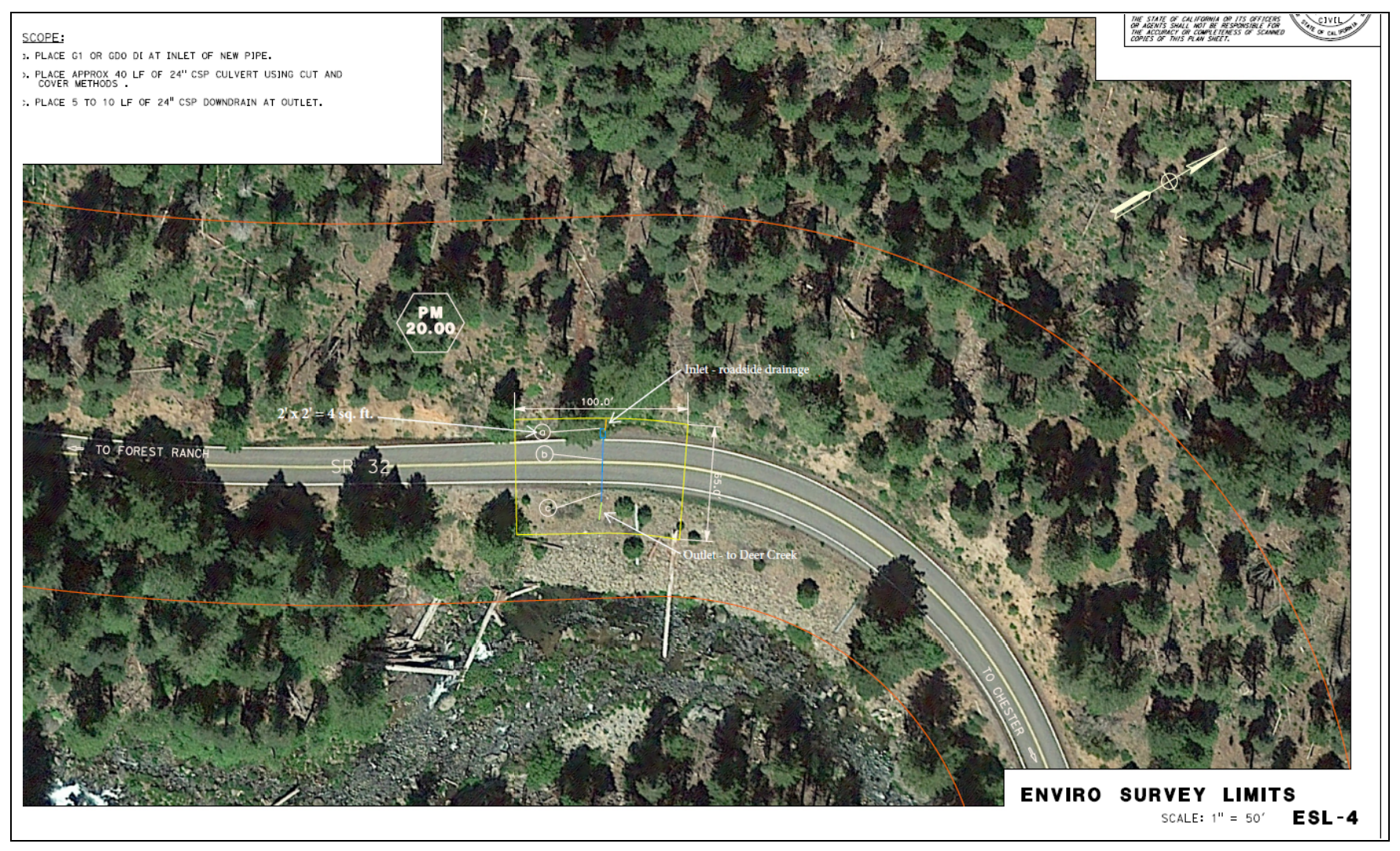
Figure 2. Impacts at Location 3 (PM 20.00)