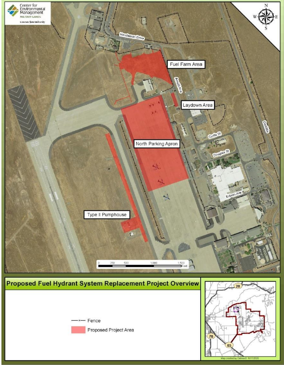
Figure 2 – Project Overview Map