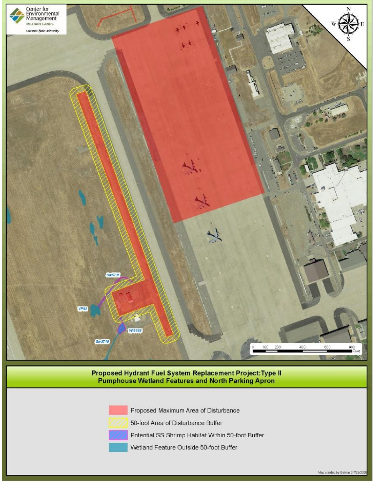
Figure 4: Project Impacts Map – Pumphouse and North Parking Apron