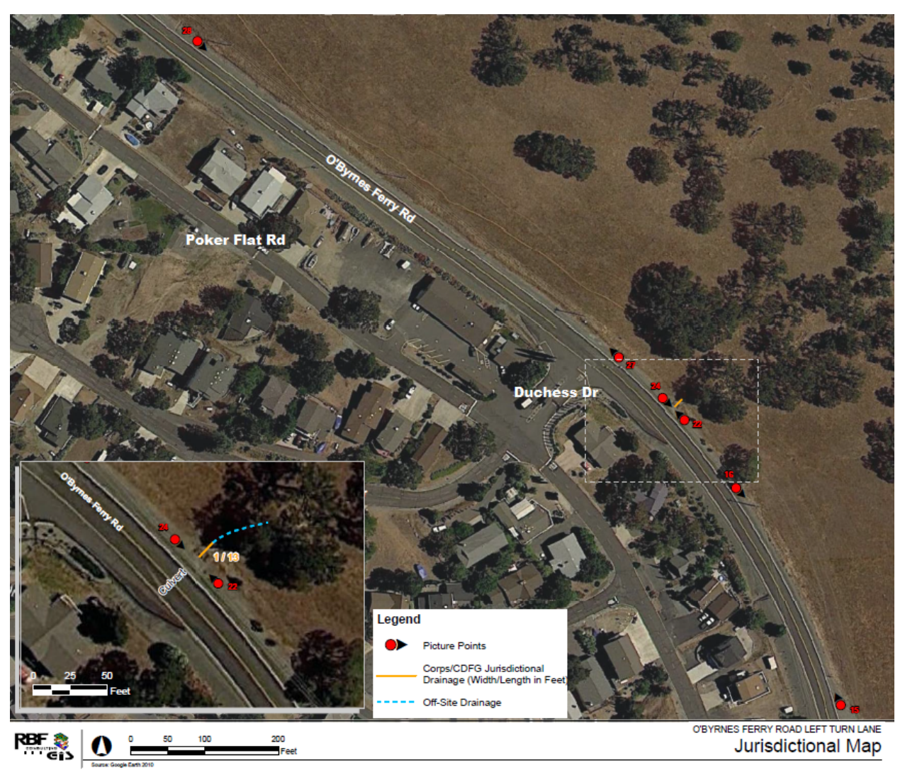
Figure 2- Project Area Water Features