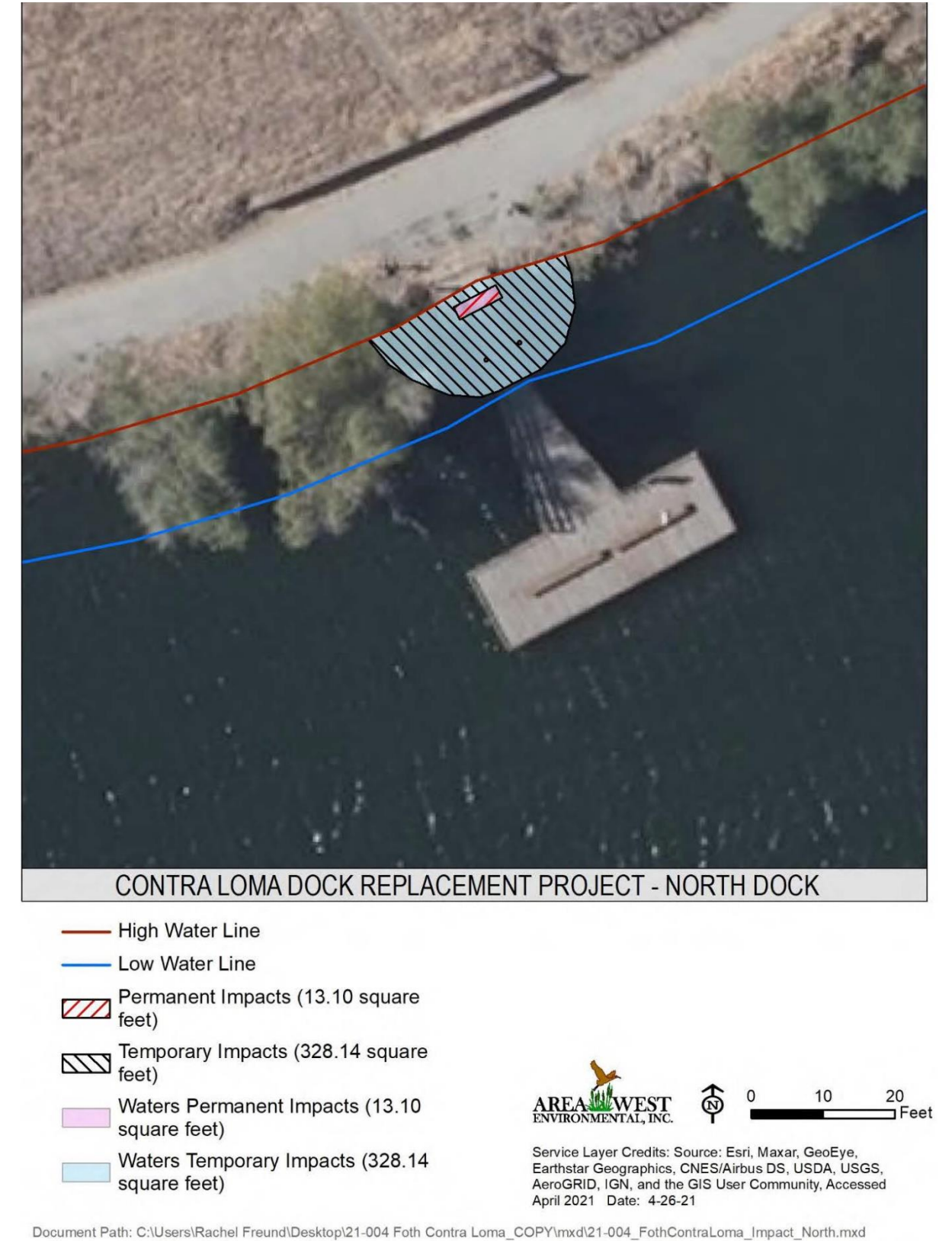
Figure 2—Impact Map #1