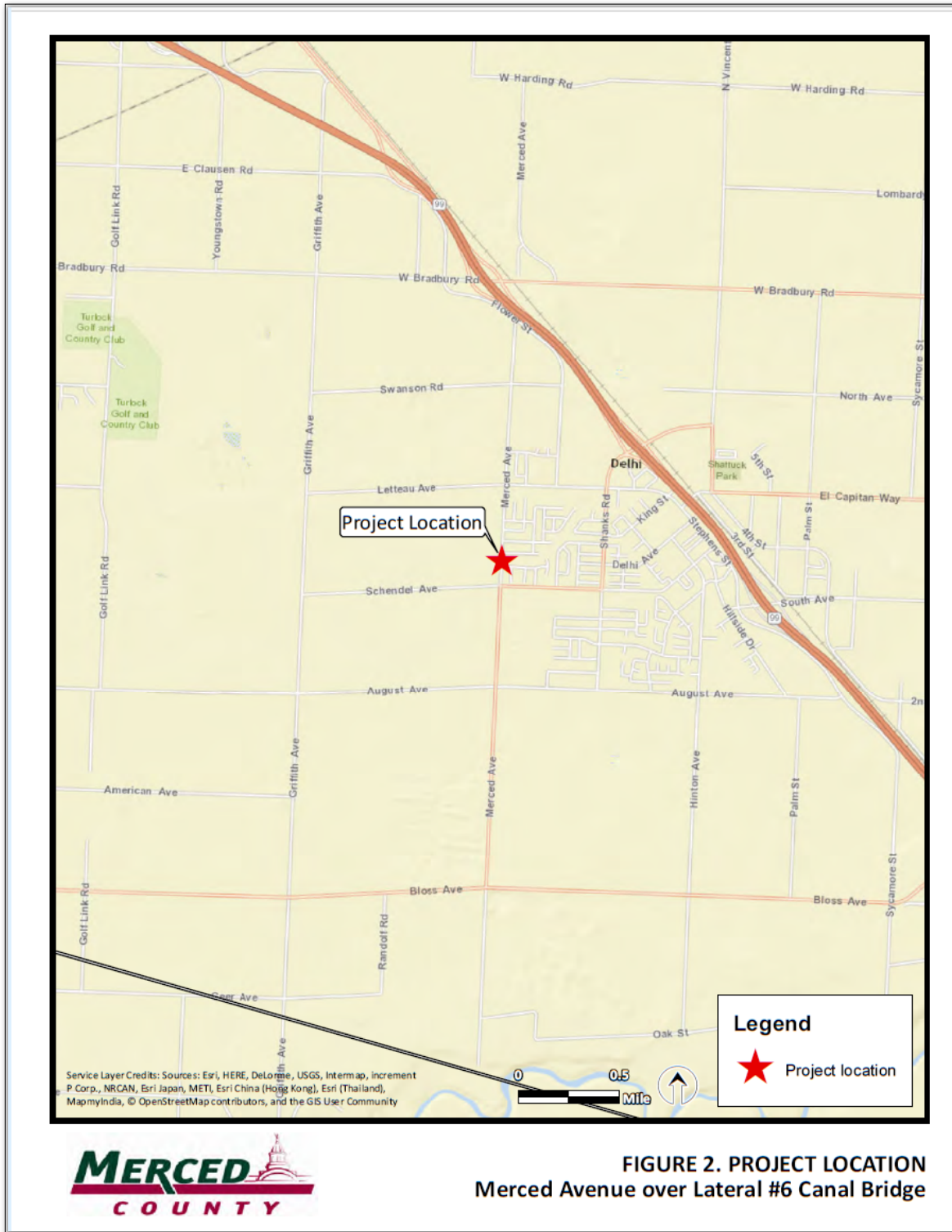
Figure 1: Project Site Vicinity Map