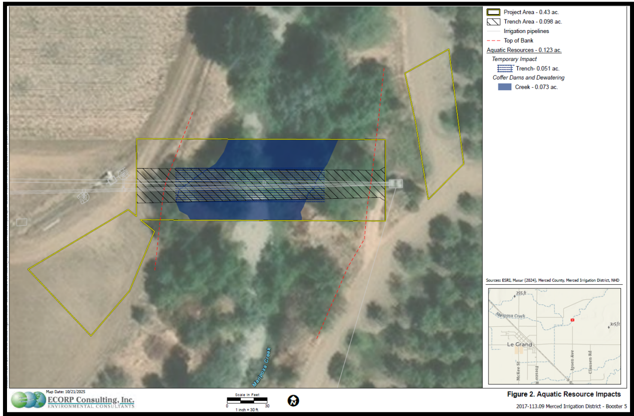
Figure 2: Aquatic Resource Impacts