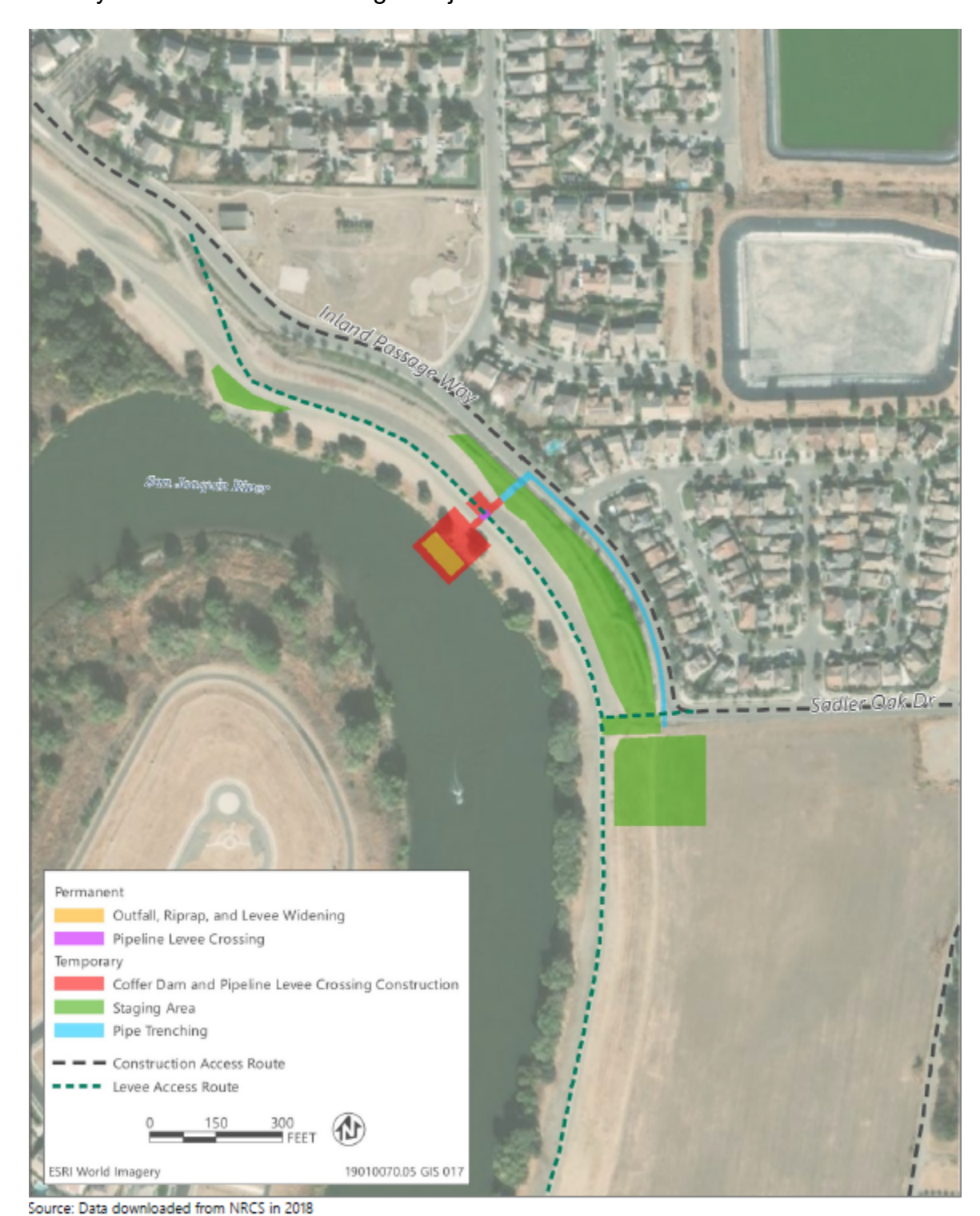
Figure 3 Outfall Disturbance Areas Near Aquatic Resources