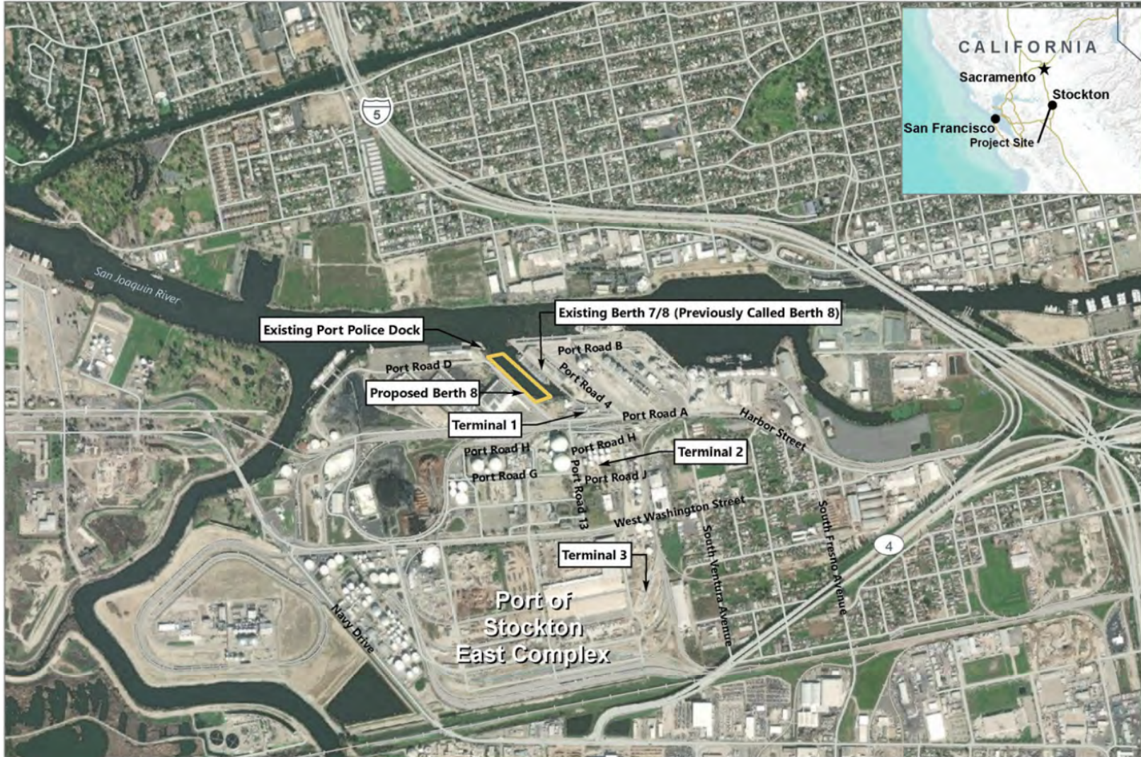
Figure 1: Project Site and Vicinity Map