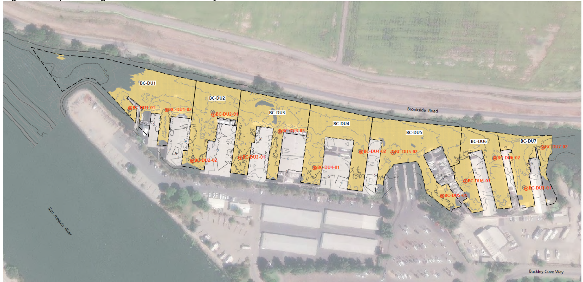
Figure 1: Map of Dredge Location and Boundary

HORIZONTAL DATUM: California State Plane, Zone 3, NAD83, U.S. Survey Feet VERTICAL DATUM: MLLW