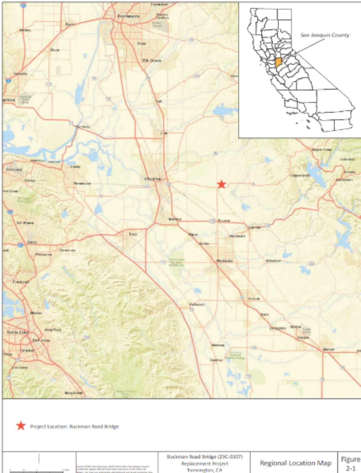
Figure 1: Regional Location Map