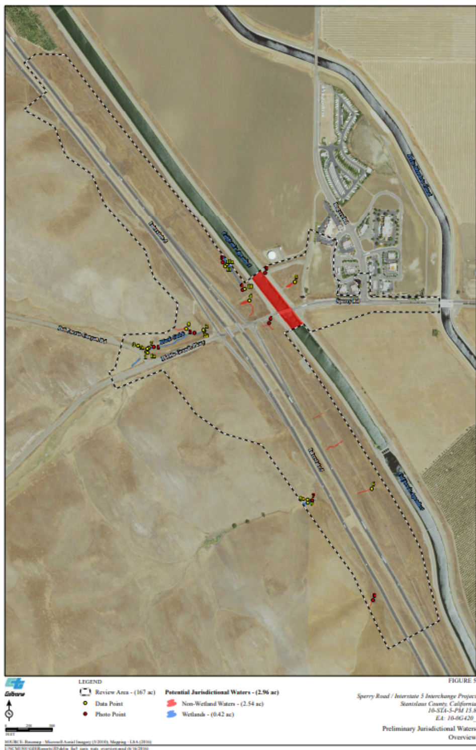
Figure 2: Aquatic Resources Map