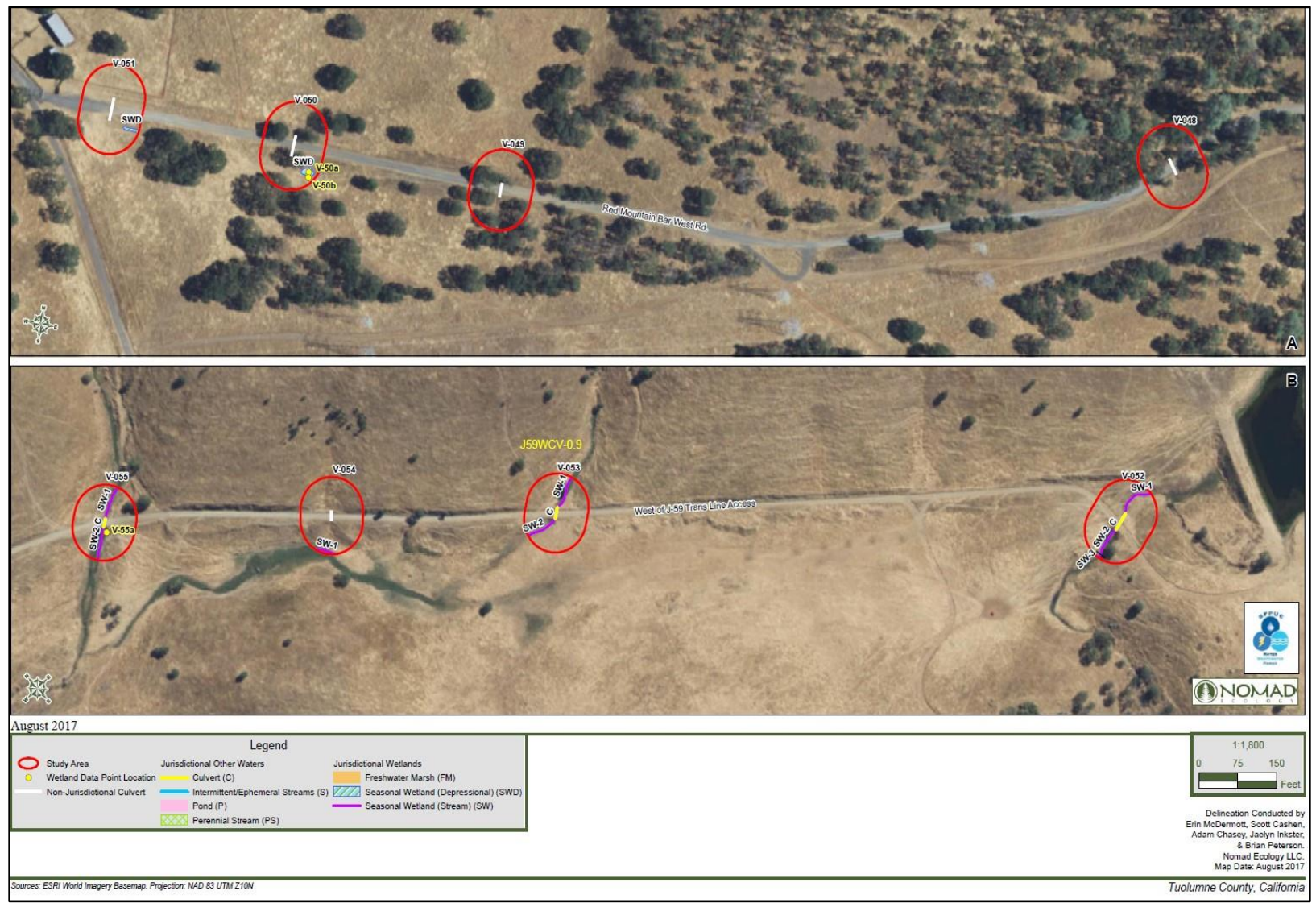
Figure 2 – Impacts to Aquatic Resources Map