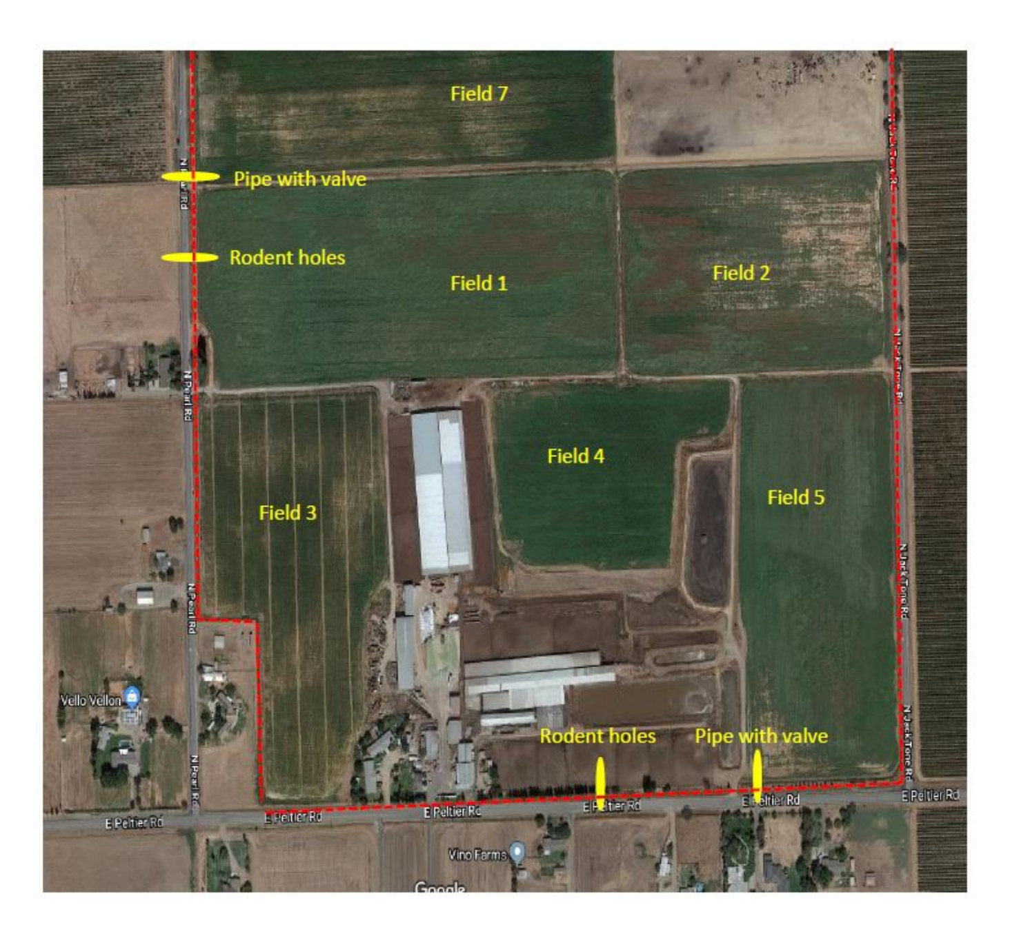
Silva Brothers Dairy #1 Previous Off-Property Points of Discharge (the red dashed line indicates the property boundary)