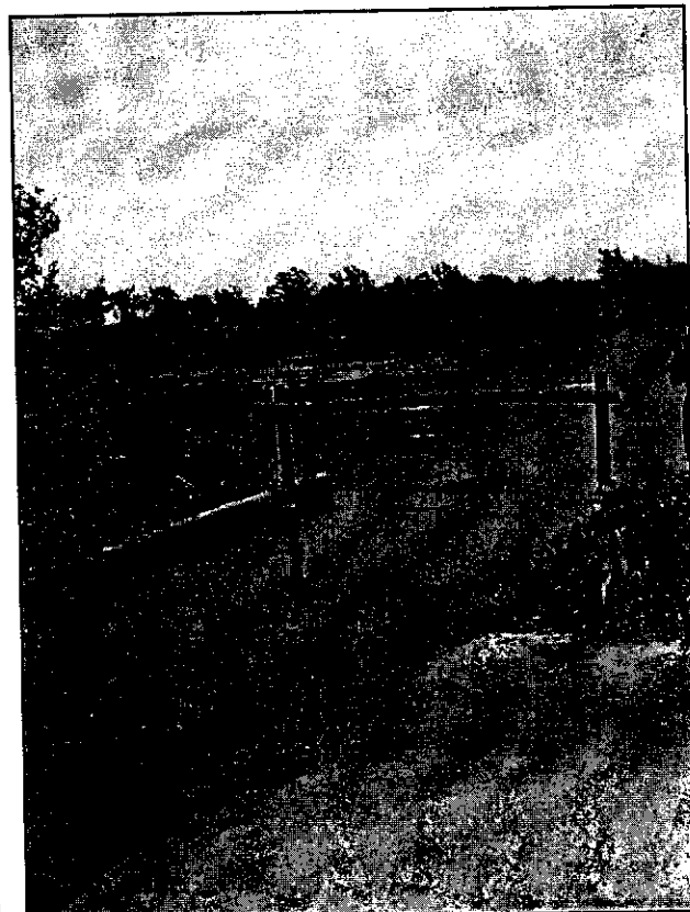
Figure 1.3: Flushed manure entering storage facility (K. Christophel, 2002).

Fertigation: The irrigation of nutrient-rich water for fertilizer using irrigation equipment.