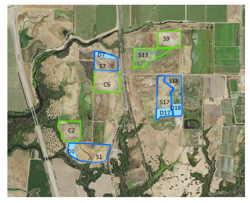
Figure 3. Example of two of the treatment wetlands (wetland 17 and 18 labeled in Figure 2), with deep-water treatment cells at the downstream end, at Cosumnes River Preserve. The blue lines show the direction of water flow.

Figure 2. Four wetlands with deep-water treatment cells and an internal "check" levee were constructed (bordered by blue lines) and compared to 4 control wetlands (bordered by green lines) at the Cosumnes River Preserve demonstration area. The four control wetlands received traditional wetland management and will be monitored similarly to the treatment wetlands.