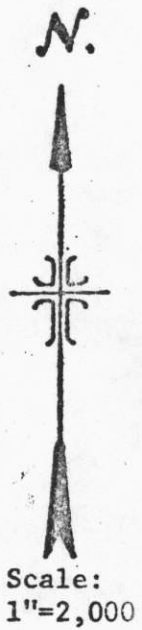
SITE MAP MITCHELL CAMP South of Palo Verde - Imperial County NE \frac{1}{4} of the NW \frac{1}{4} of Section 23, T10S, R21E, SBB&M USGS Cibola, Ariz. 7.5 min. Topographic Map