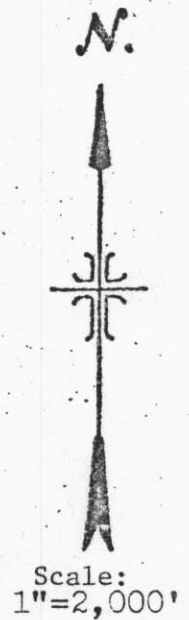
SITE MAP VISTA RV AND AQUATIC PARK Northeast of Palm Springs - Riverside County The Center Portion of Section 27, T3S, R5E, SBB&M USGS Seven Palms Valley 7.5 min. Topographic Map