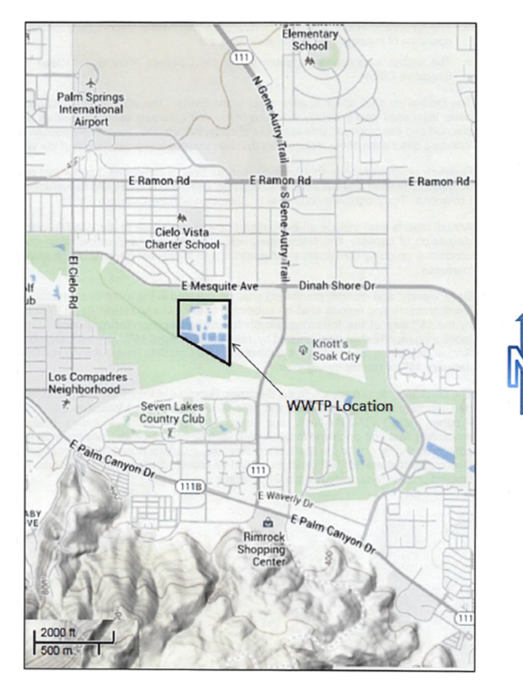
Figure 1. Map with Facility Location.

GeoTracker ID: WDR100032535 WDID: 7A330114012