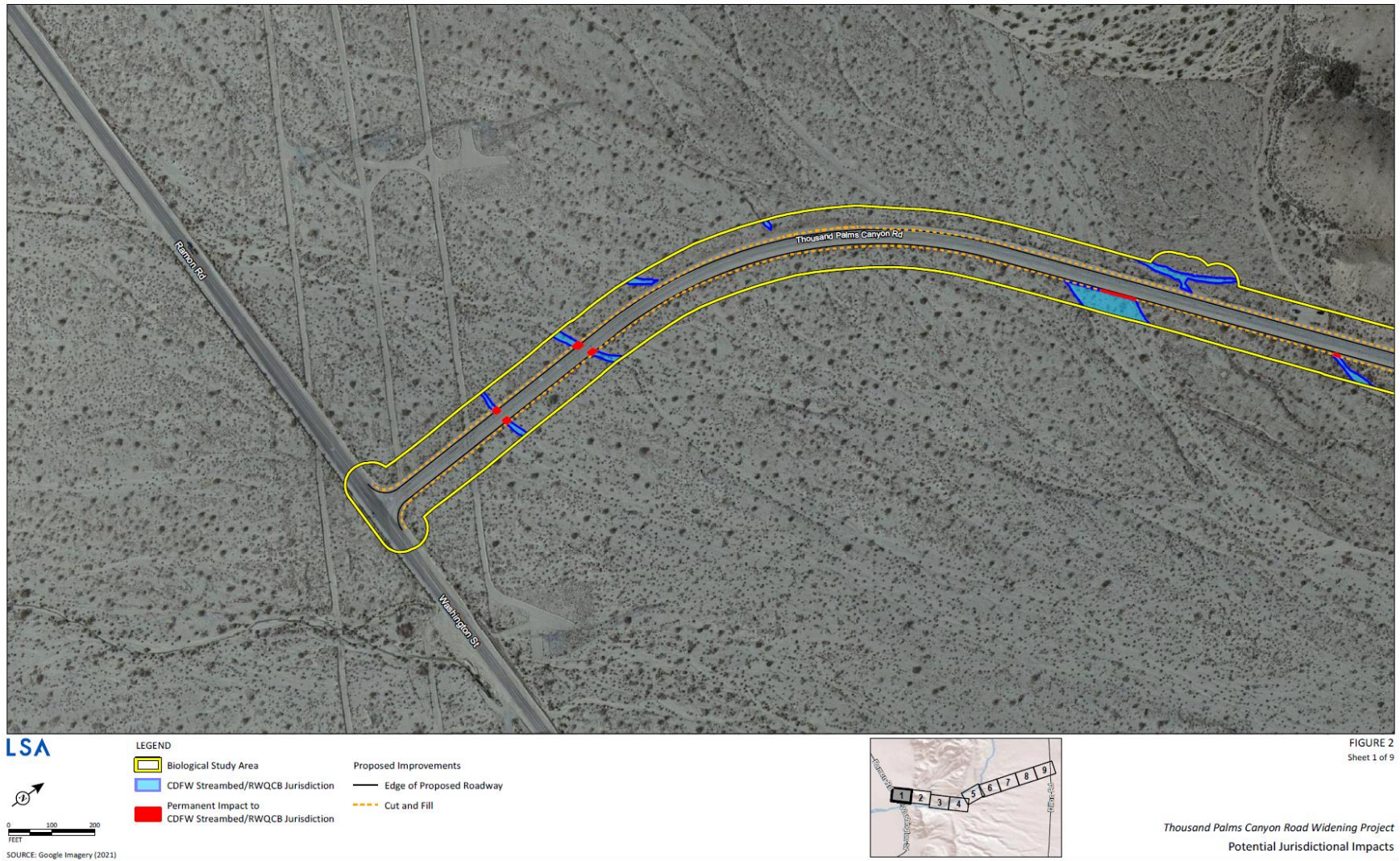
Figure 2. Potential Jurisdictional Impacts (RCTD, 2021).