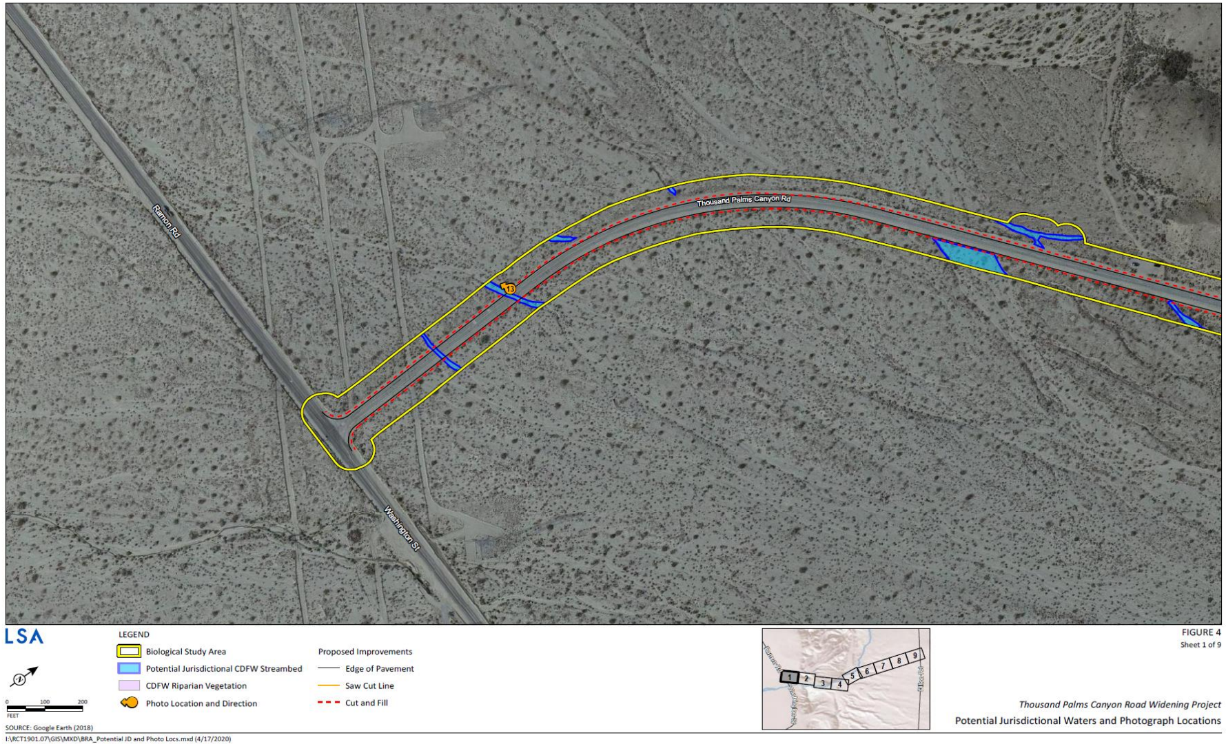
Figure 4. Potential Jurisdictional Waters (RCTD, 2021).