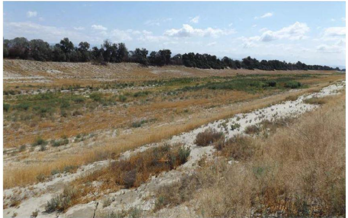
Photo 2. Picture of the Whitewater River Stormwater Channel looking southeast, the location of retention basins.