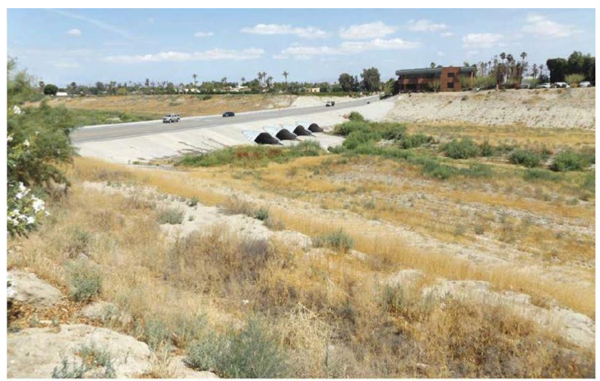
Photo 1. Picture of Cook Street, at the western end of the Whitewater River Stormwater Channel retention basin area.