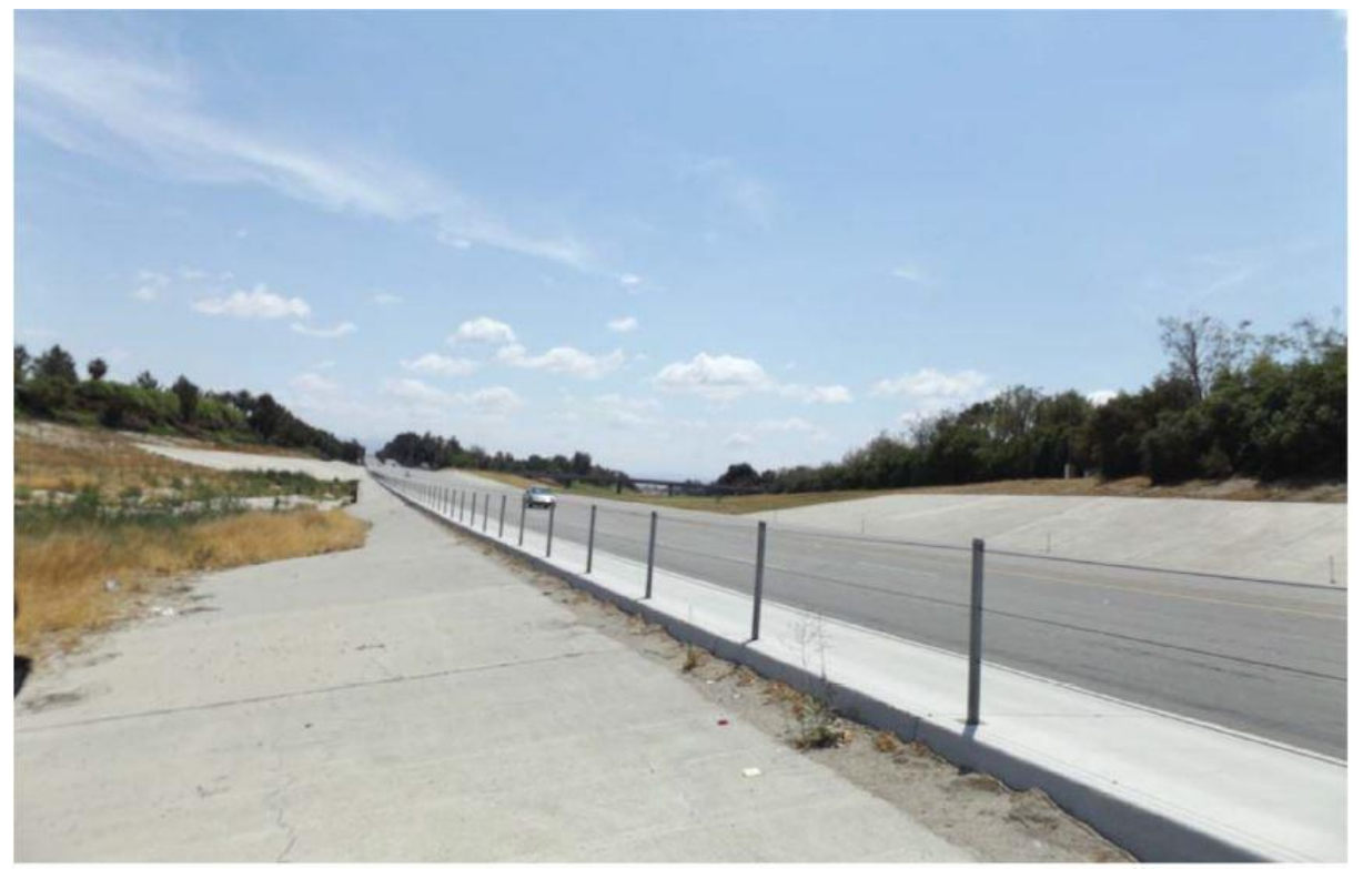
Photo 3. Picture of Fred Waring Drive, at the eastern end of the Whitewater River Stormwater Channel retention basin area.