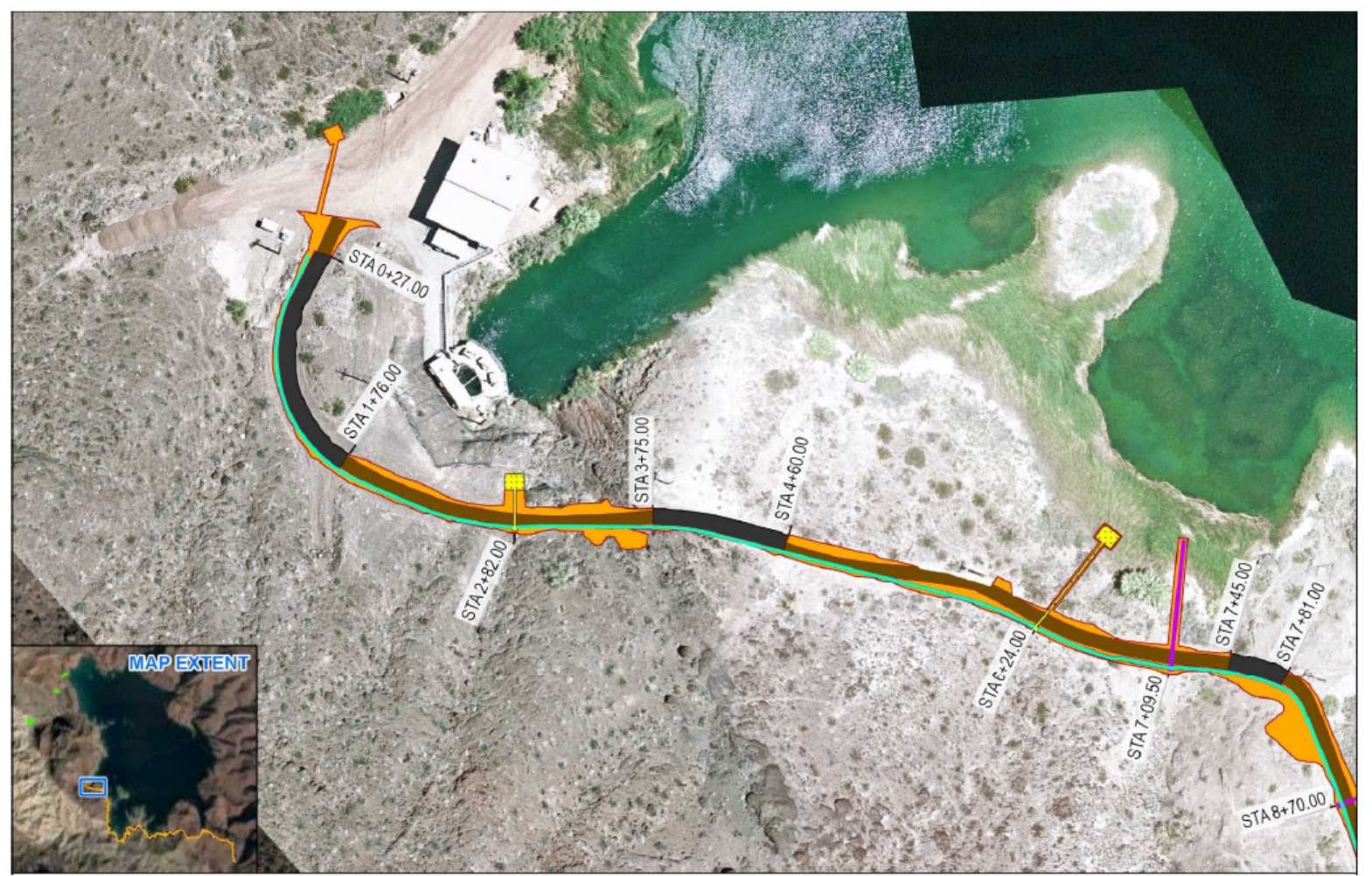
Figure 4: Project Components