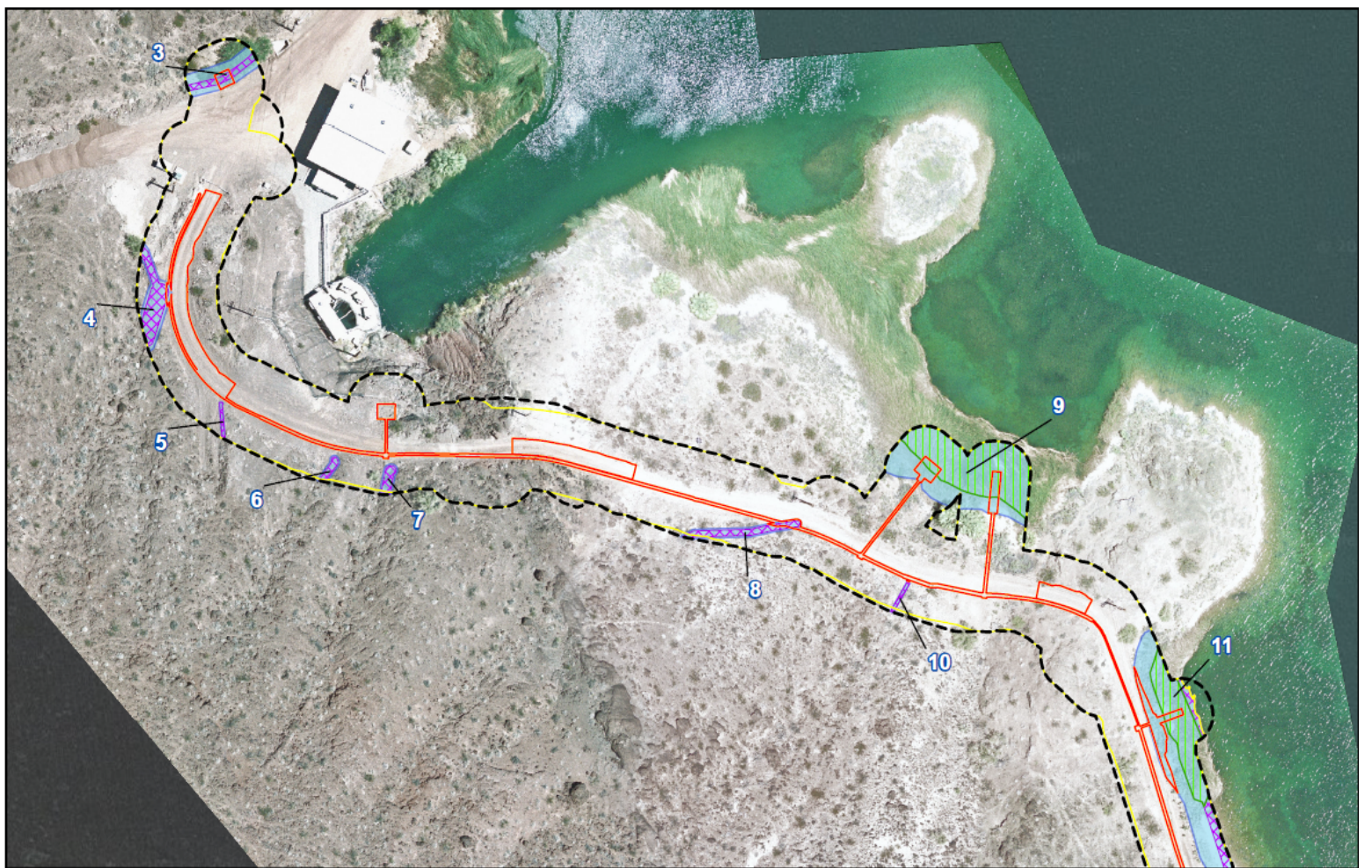
Figure 5: Jurisdictional Waters