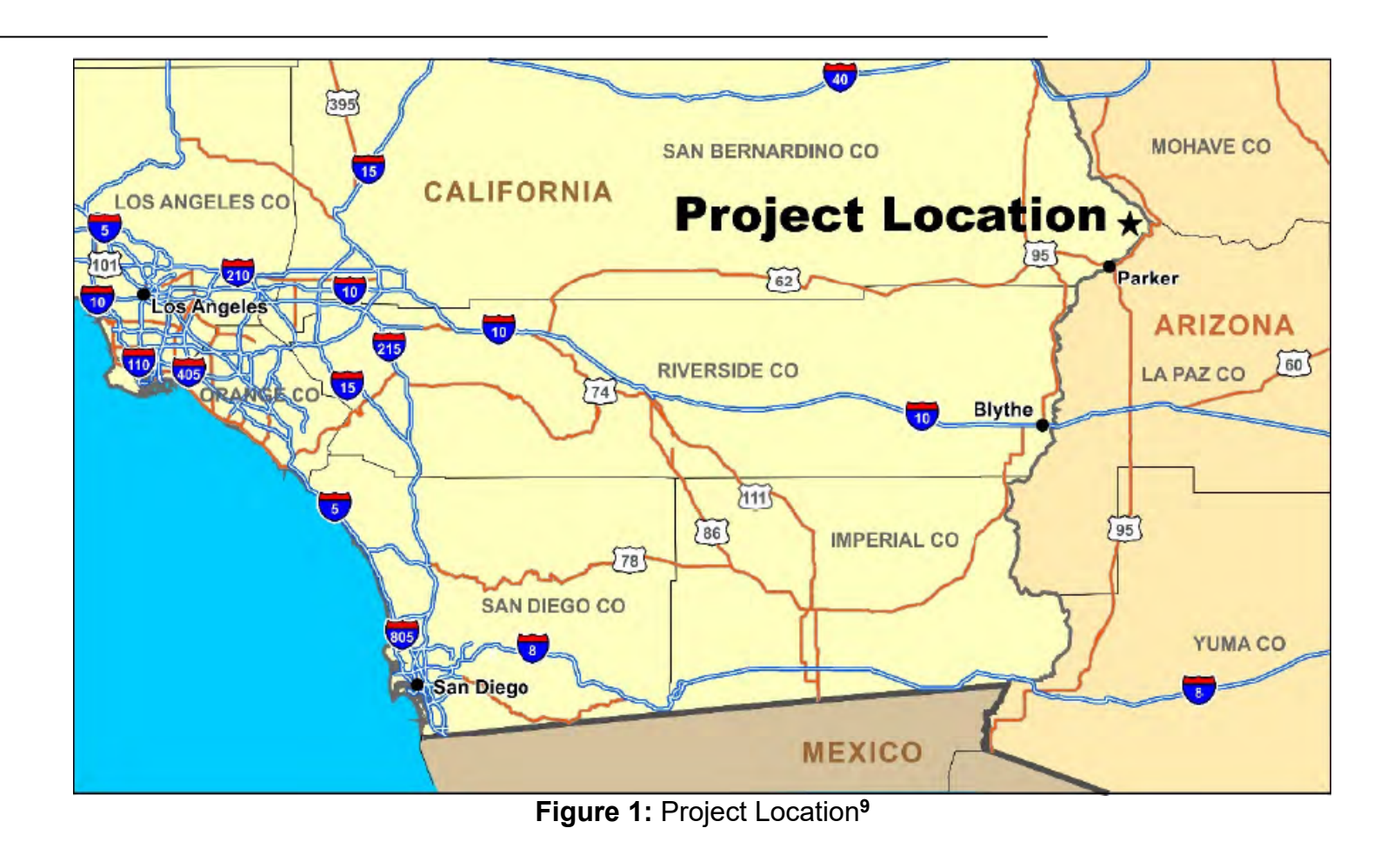
<sup>9</sup>Metropolitan Water District of Southern California. September 2023. Clean Water Act Section 401 Water Quality Certification and Order for the Copper Basin Discharge Valve Replacement and Access Road Improvements Project.