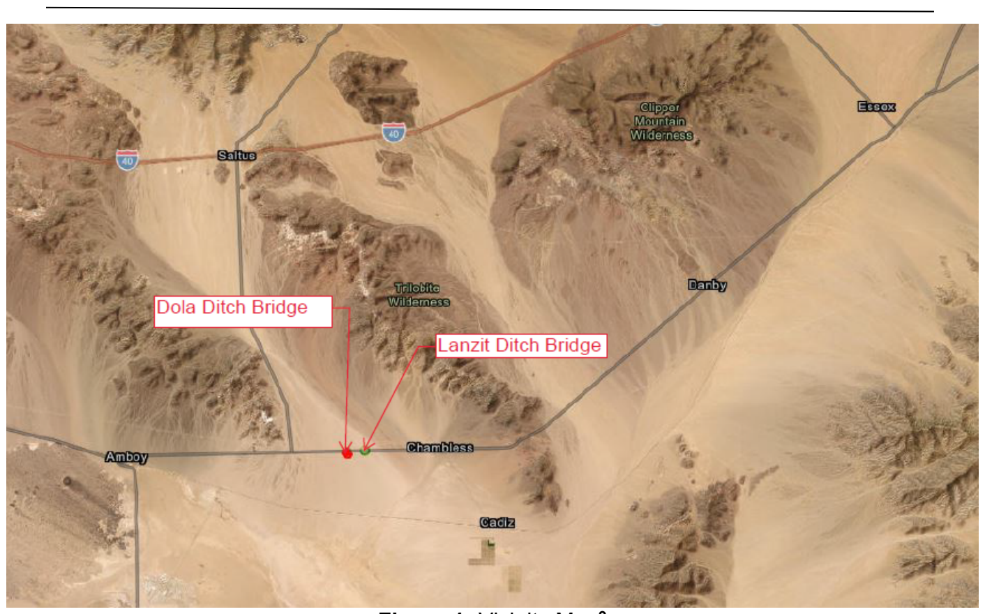
Figure 1: Vicinity Map9