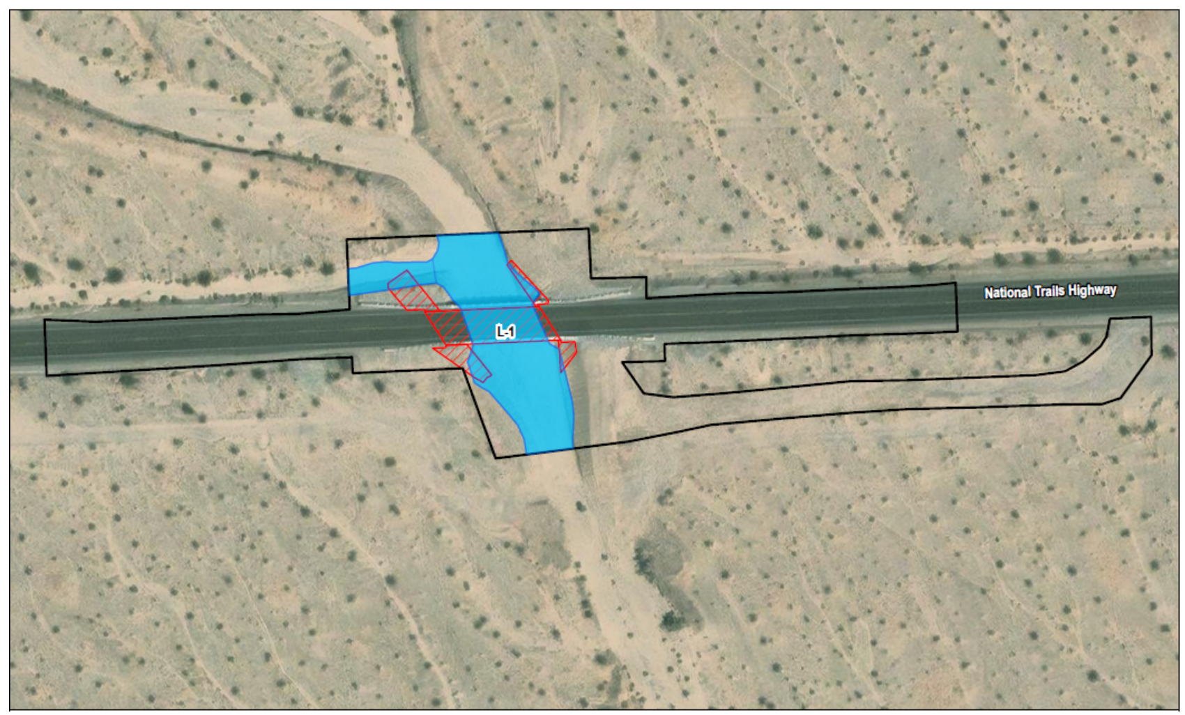
Figure 3: Lanzit Ditch Bridge jurisdictional features.