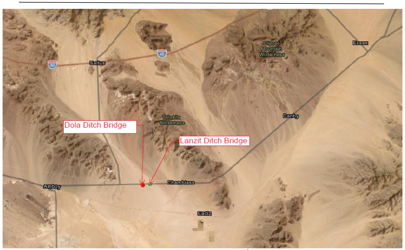
Figure 1: Vicinity Map9