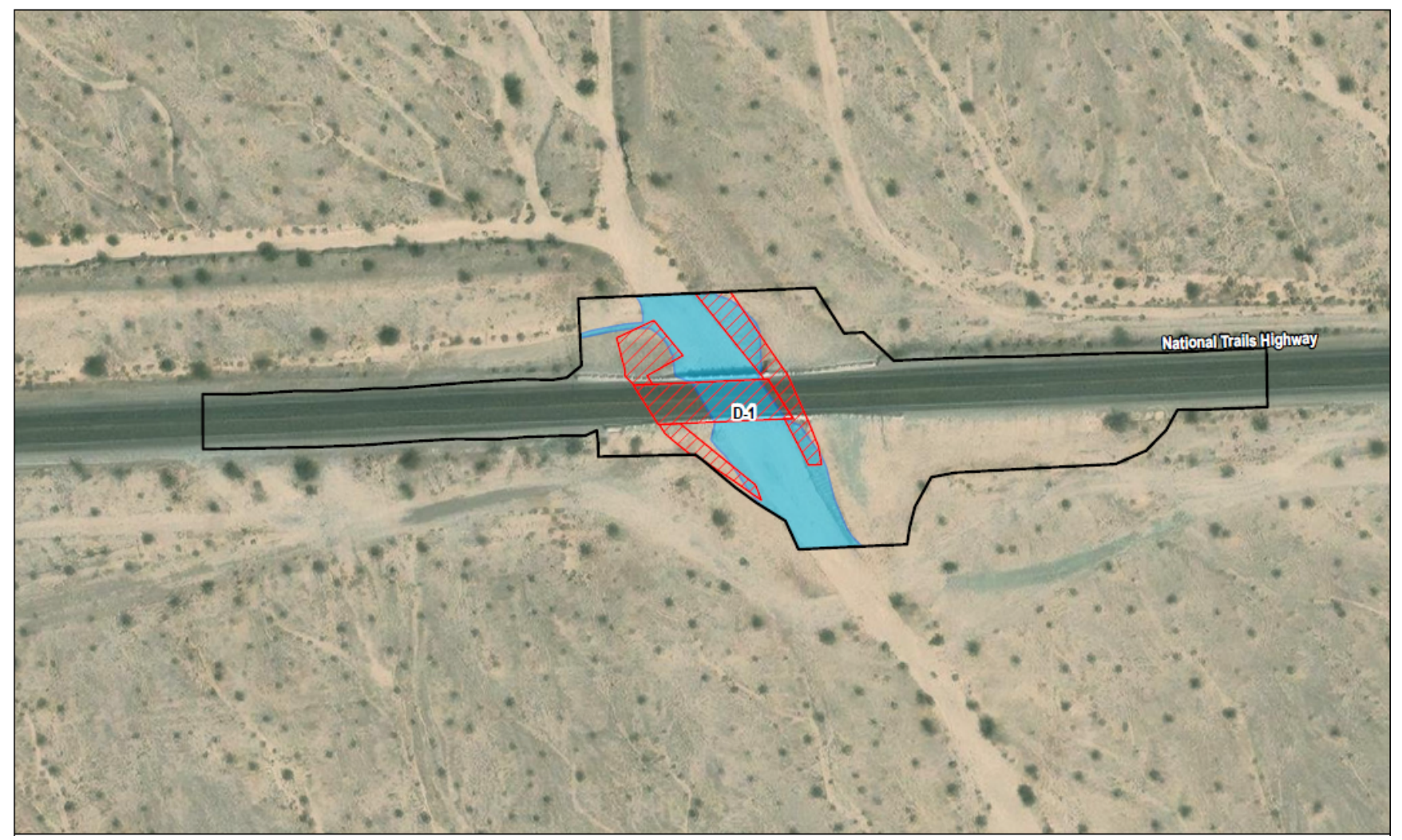
Figure 3: Dola Ditch Bridge jurisdictional features.