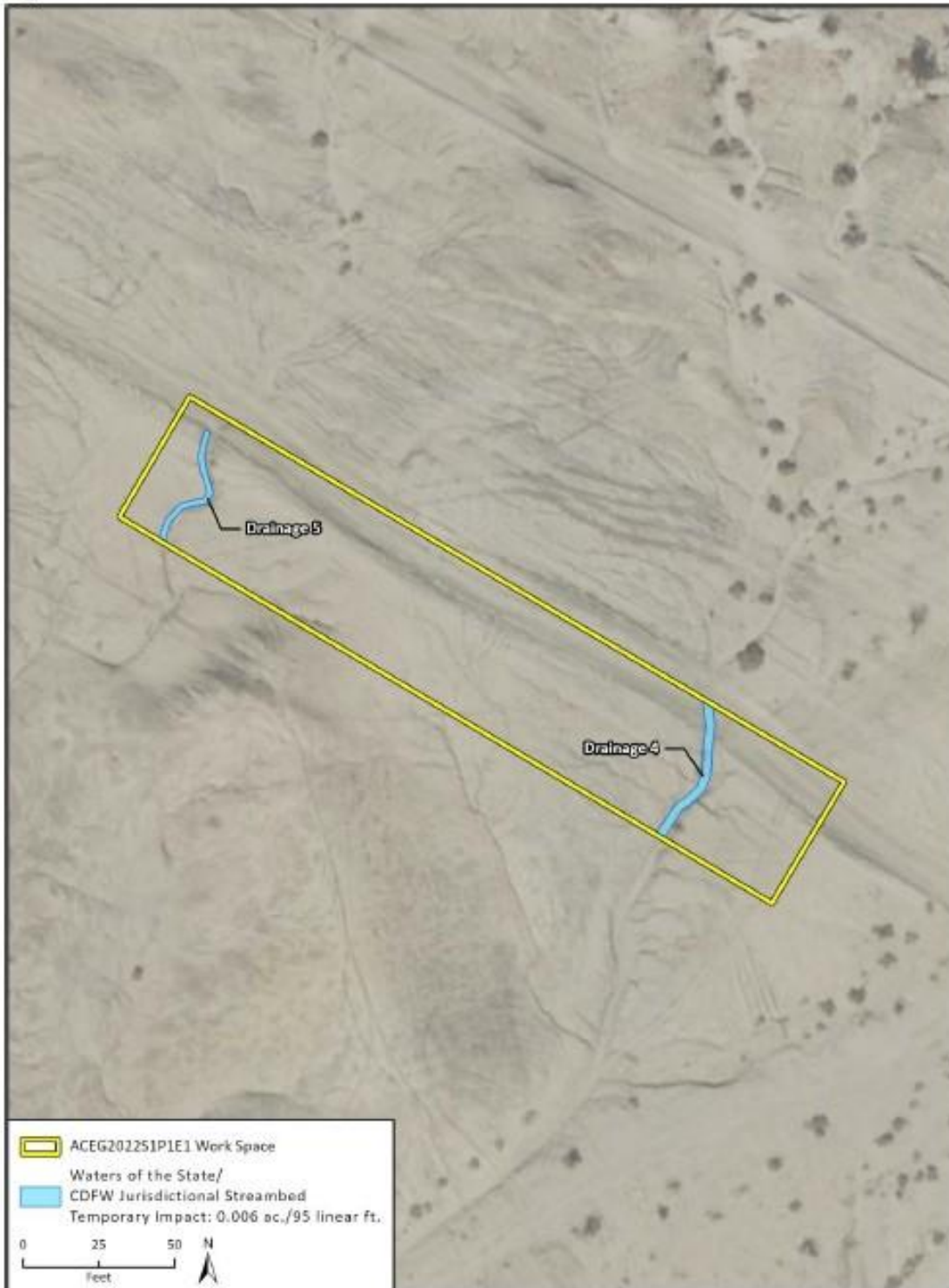
Figure 5. Project site ACEG2022S1P1E2.