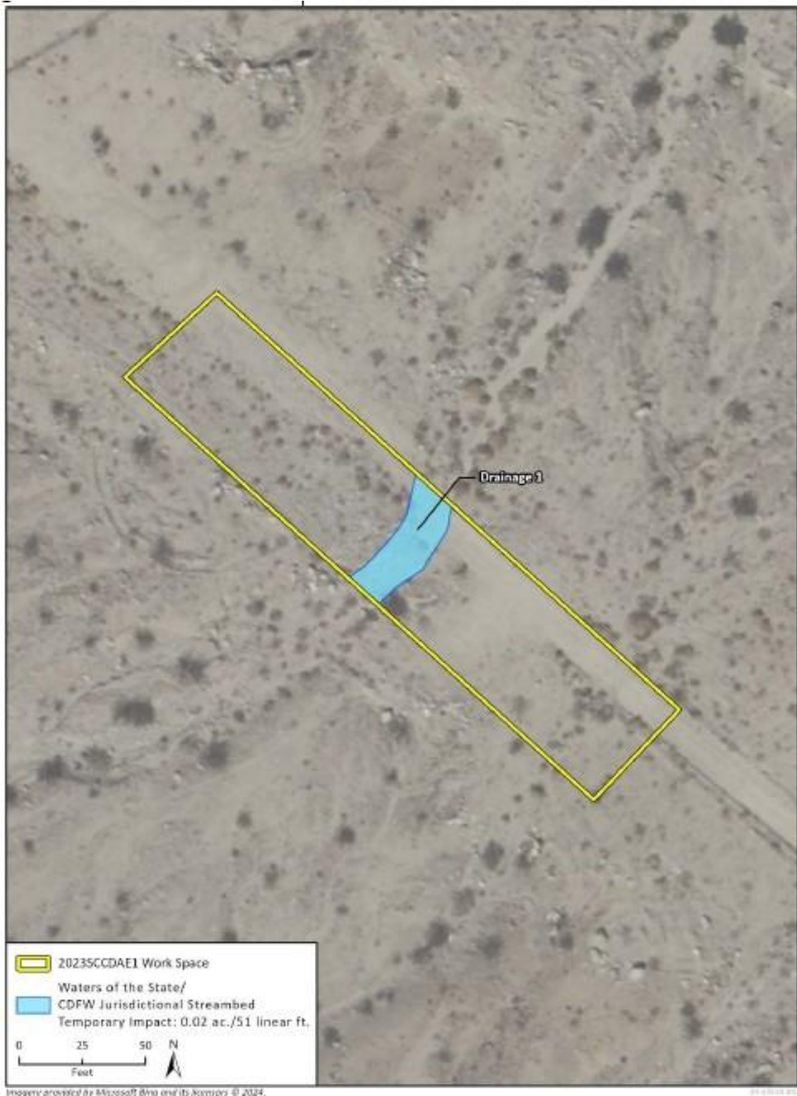
Figure 2. Project site 2023SCCDAE1.