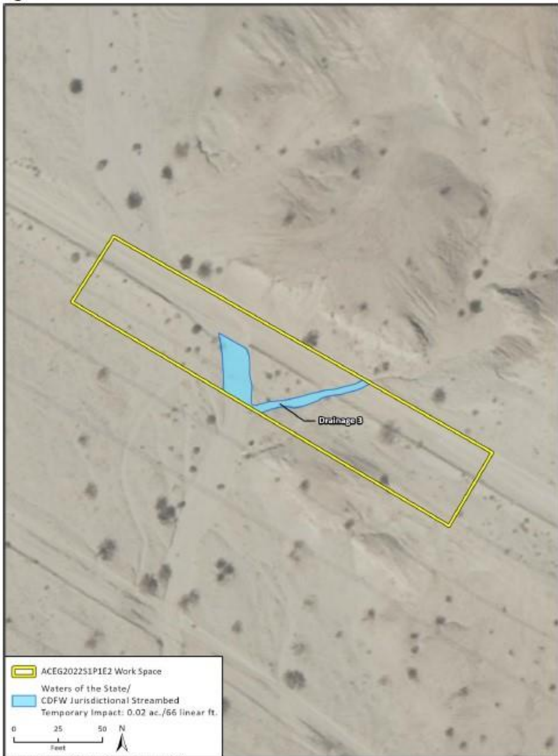
Figure 4. Project site ACEG2022S1P1E1.