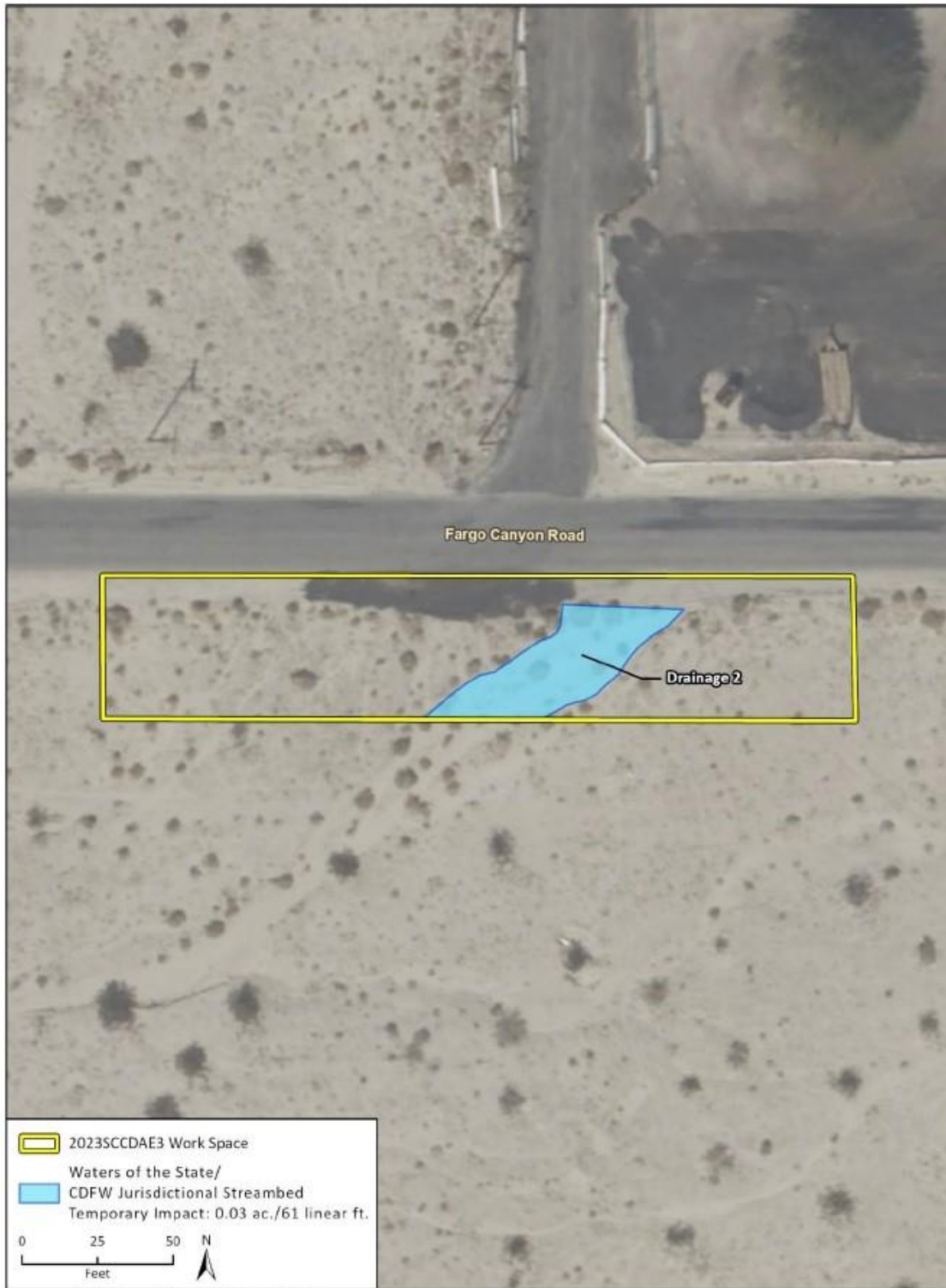
Figure 3. Project site 2023SCCDAE3.