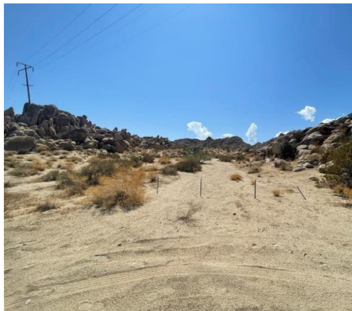
Figure 5: Photograph of the location of TSP4964326E, looking southeast.