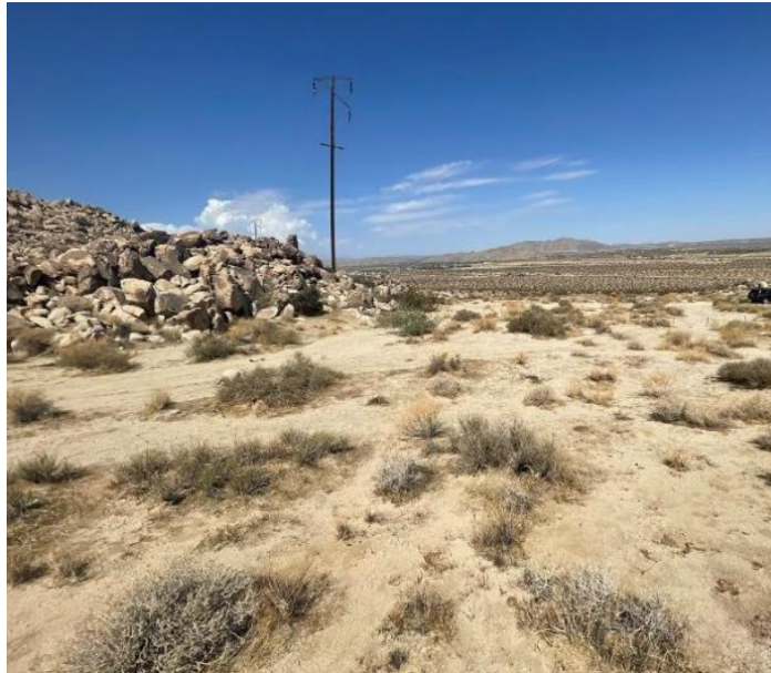
Figure 4: Photograph of the location of TSP4964326E, looking northwest.