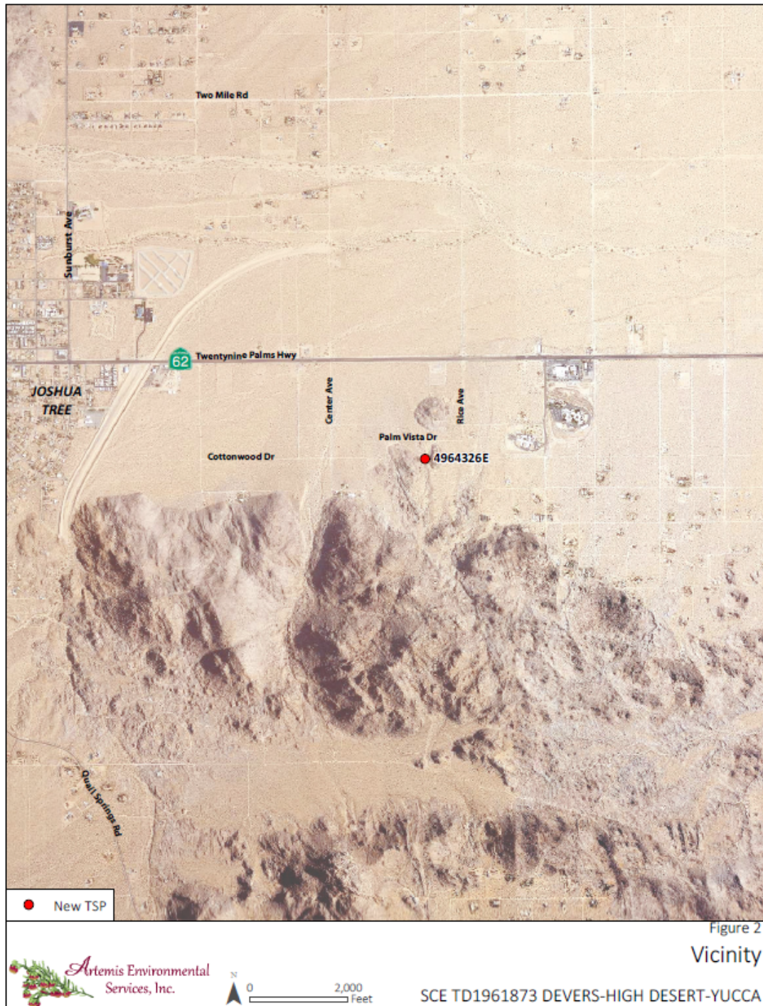
Figure 2: Vicinity Map