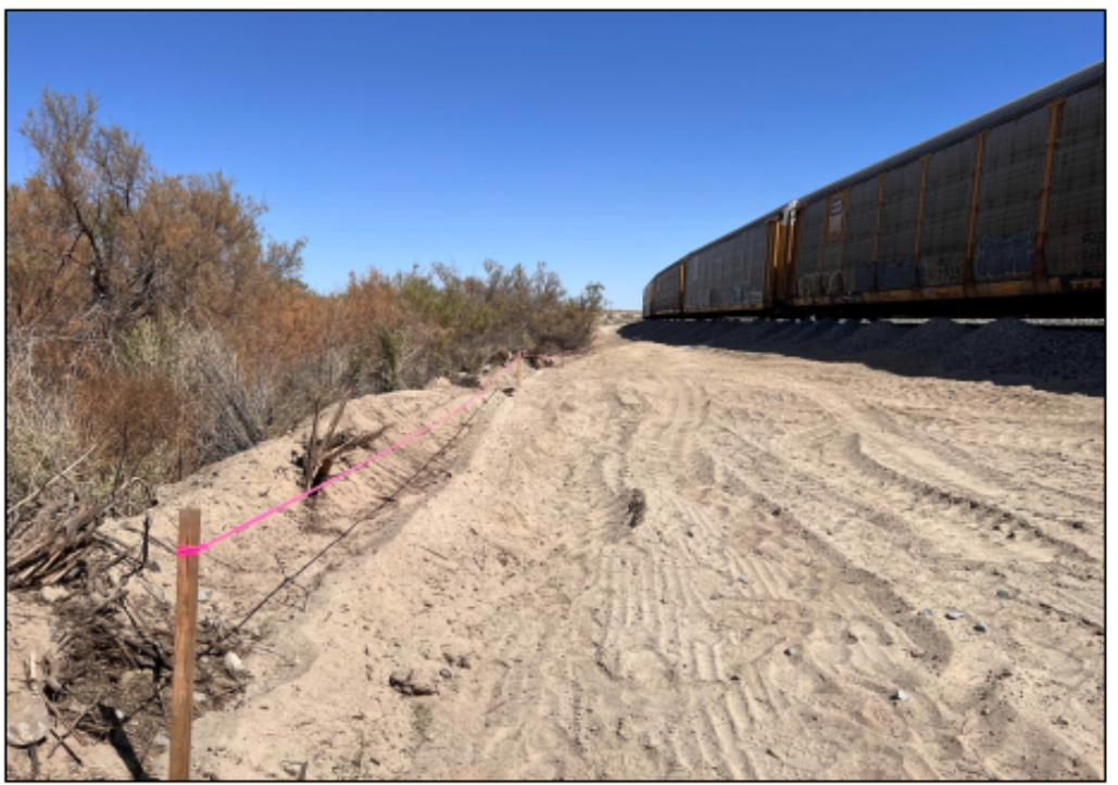
Photo 1. Northeast side of track repair fill area adjacent to Wetland North. Note avoidance flagging.