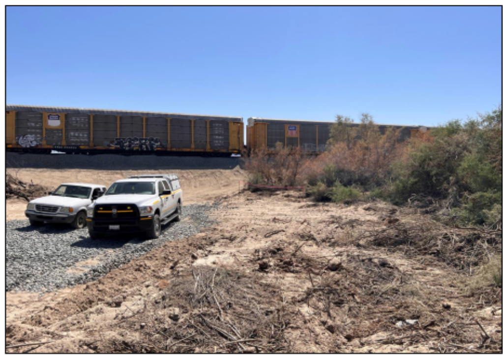
Photo 2. Northeast side of track facing track repair fill location. Note avoidance flagging.