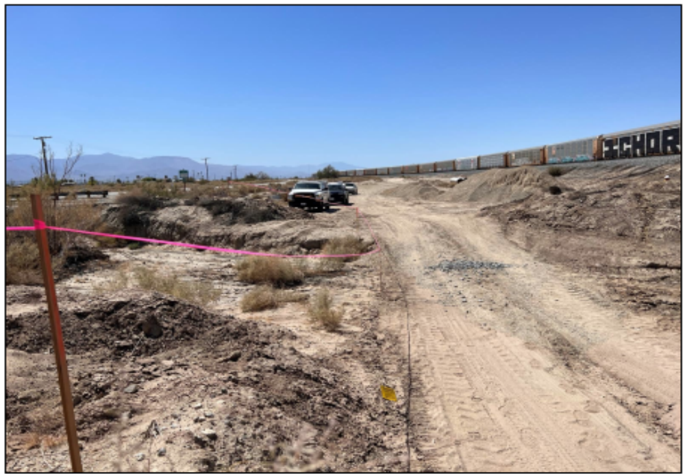
Photo 3. Southwest side of track showing existing access road through drainage. Note avoidance flagging.