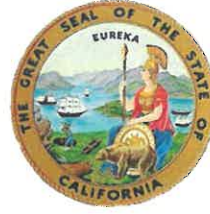
GAVIN NEWSOM LIEUTENANT GOVERNOR