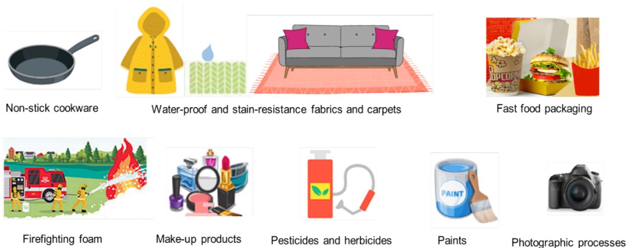
Figure 1. Examples of consumer products containing PFAS.

The primary sources of PFAS are: fire training/fire response sites, industrial sites landfills, and wastewater treatment plants/biosolids. The following picture shows examples of products containing PFAS.