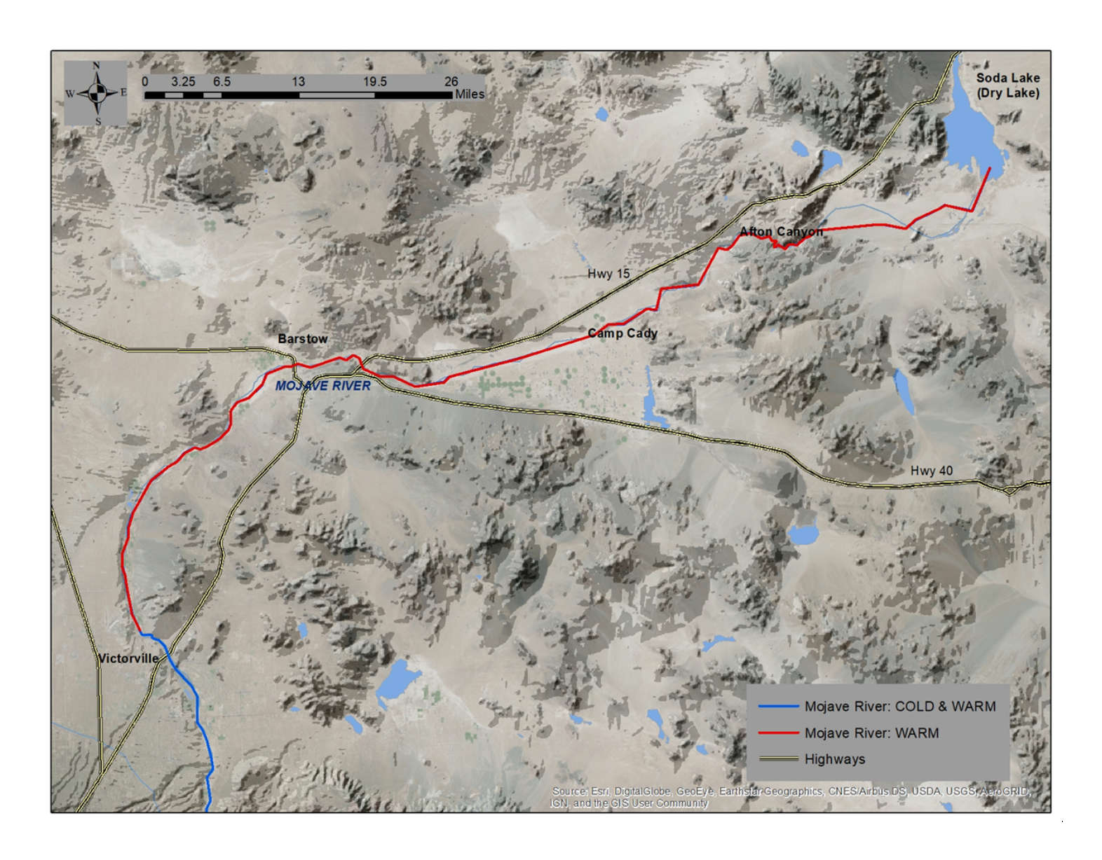
The Chapter 2, Figure 2.1-1 on Page 2-43 titled "Map showing locations where the COLD and WARM freshwater habitat beneficial uses apply for the Mojave River", shown below, will be replaced with a revised version of Figure 2.1-1 and additional explanatory text will be inserted below the figure, as shown on the next page.