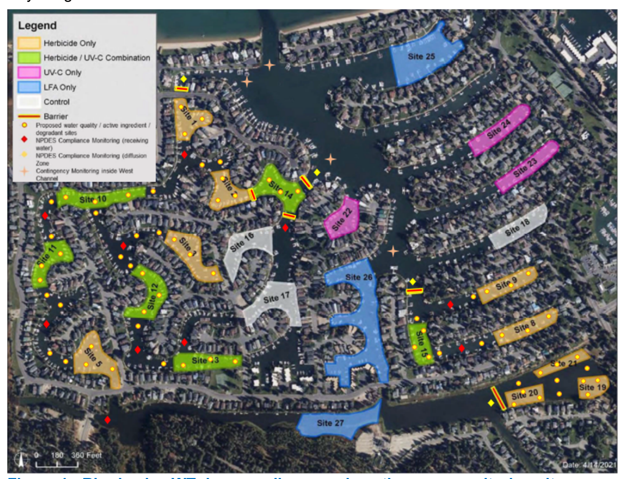
Figure 1 - Rhodamine WT dye compliance and contingency monitoring sites

Figure 1 - Rhodamine WT dye compliance and contingency monitoring sites. Figure shows the CMT sites, compliance monitoring locations, contingency monitoring locations, and the locations of double turbidity curtains in West Channel and the Tahoe Keys Lagoons.