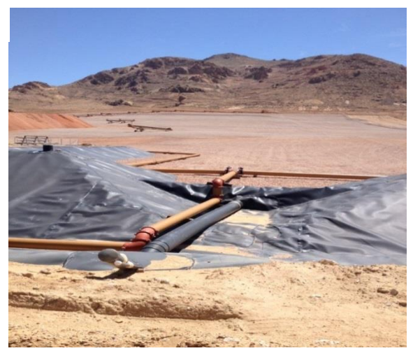
Figure 4: Close-up of heap leach pad being loaded with ore.

Requirements. Water quality compliance inspections included visual monitoring of the maintenance shop,