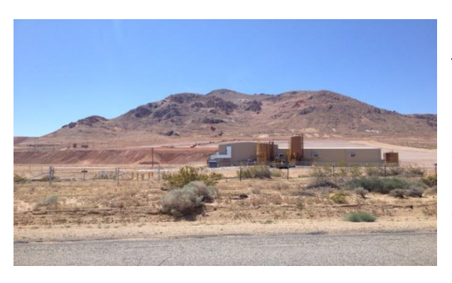
Figure 2: Soledad Mountain in background; Merrill-Crowe Plant in foreground; heap leach pad with ore to the left of the plant, and ready for ore behind and to the right of the plant

The Water Board first adopted waste discharge requirements for the project in 1997 but plans changed and the permit was never implemented. The Water Board adopted the current waste discharge requirements in 2010. The permitted mine operations use conventional open pit mining to recover the ore, cyanide heap leach to extract the gold from the ore, and a Merrill-Crowe processing plant to recover gold and silver from the cyanide solution.