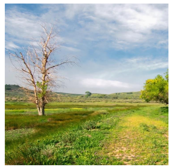
Photo 1 – Seasonal wetlands and meadow habitats are among the many types of resources that will be preserved and enhanced within the bank property.

The Southwest Resource Management Association will be the nonprofit agency that will manage and ensure the property's environmental values are protected, with oversight by the federal and state agencies. For more information on the Petersen Ranch Mitigation Bank, see the Land Veritas webpage.