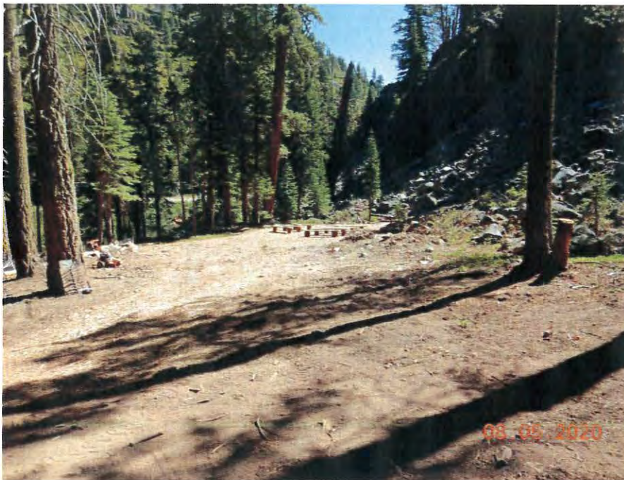
Photo 13. Recently cleared area partially stabilized with wood chips.