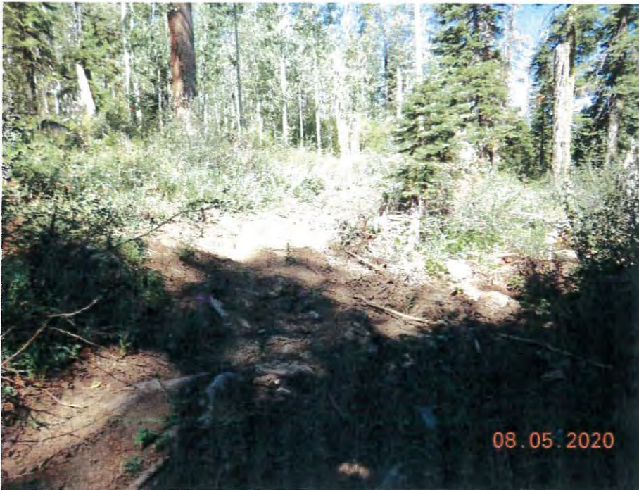
Photo 9. Temporary access road that may extend into SEZ.