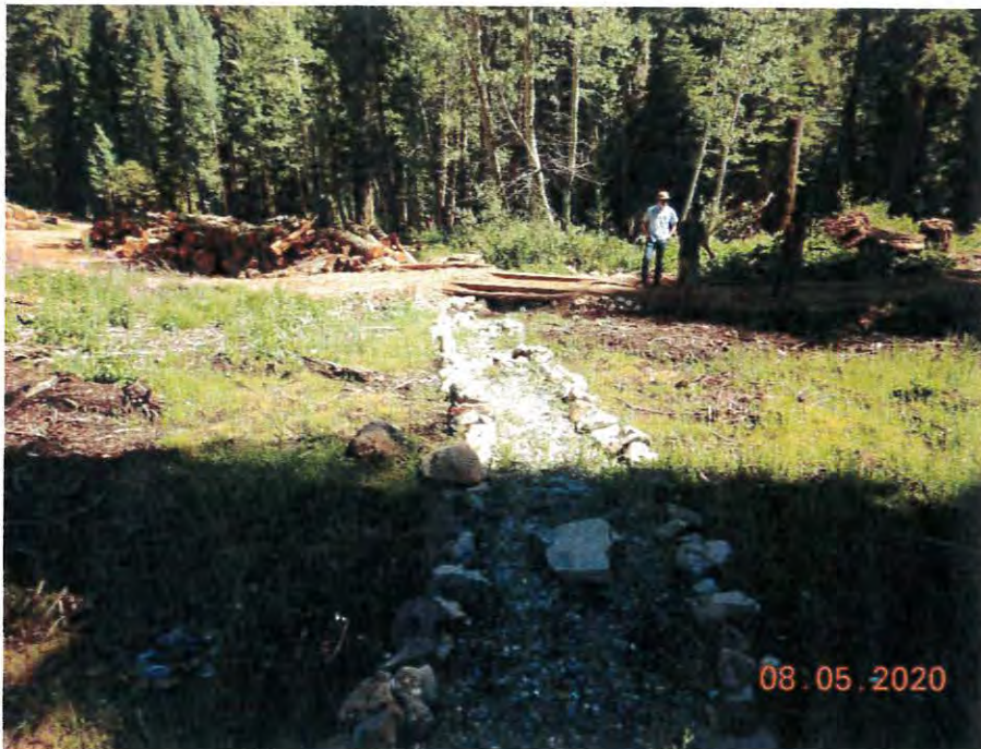
Photo 17. Modified watercourse, permanent watercourse crossing, disturbed soil in SEZ, woody debris and logs stockpiled in SEZ.