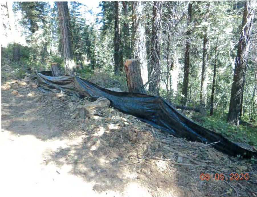
Photo 10. Downslope perimeter sediment control BMP.