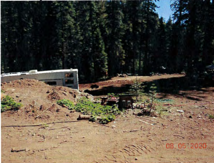
Photo 3. Recently cleared area and stockpiled soil and rock.