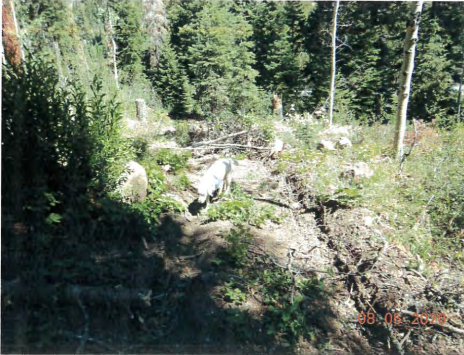
Photo 8. Temporary access road. Ruts resulting from heavy equipment driving on saturated soil.