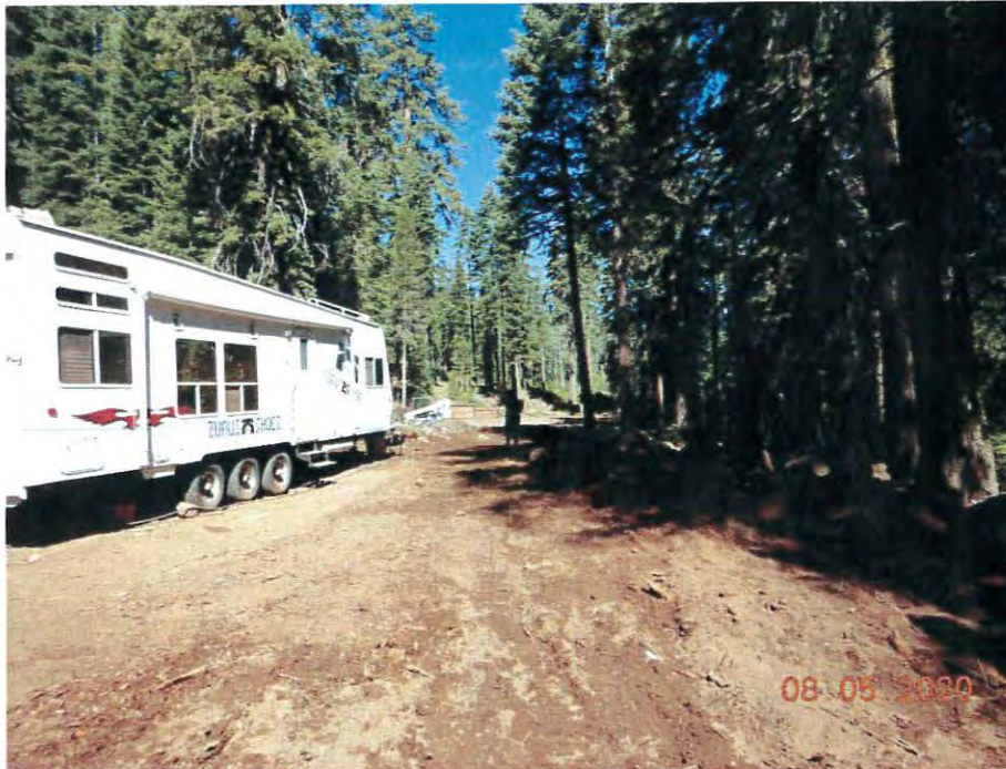
Photo 6. Recently cleared area.