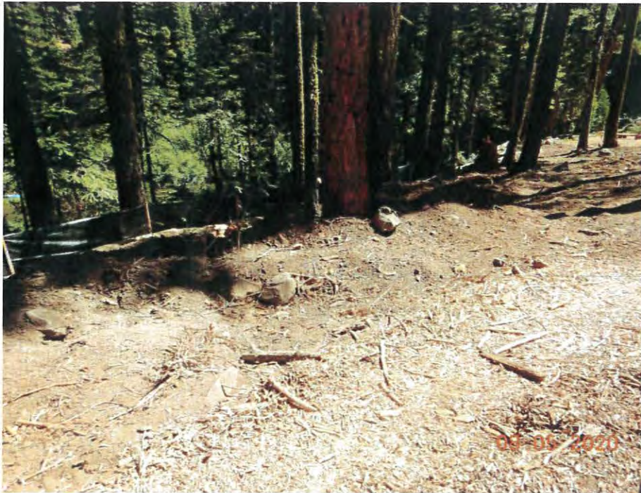
Photo 12. Windrowed soil adjacent to road surface partially stabilized with wood chips.