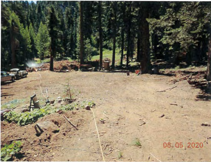
Photo 1. General site view showing recently cleared open area, windrowed soil and rock, slash pile, and small log deck.

Representative photos (of the 130 photos in the project files) included below were taken by Jim Carolan on 8/5/2020 using Nikon Coolpix W300 camera.