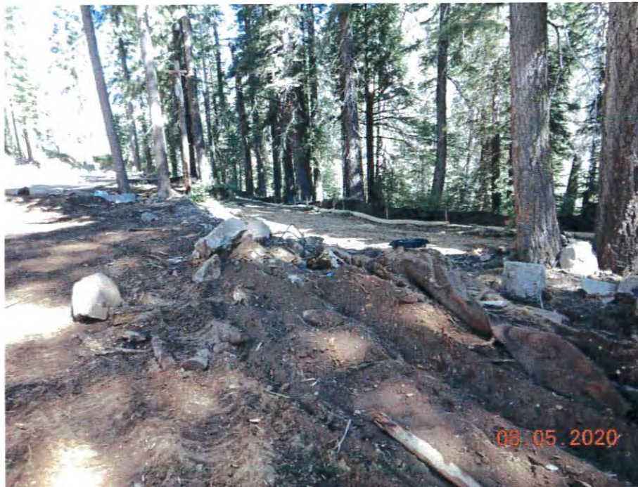
Photo 7. Windrowed soil and rock, downslope perimeter BMPs