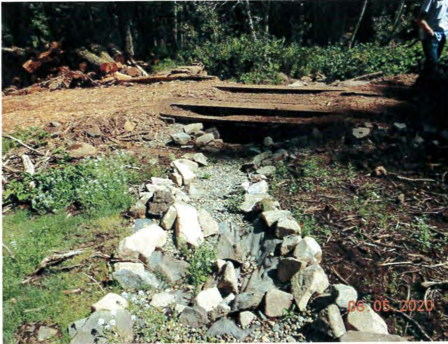
Photo 18. Modified watercourse, permanent watercourse crossing, disturbed soil in SEZ, woody debris and logs stockpiled in SEZ