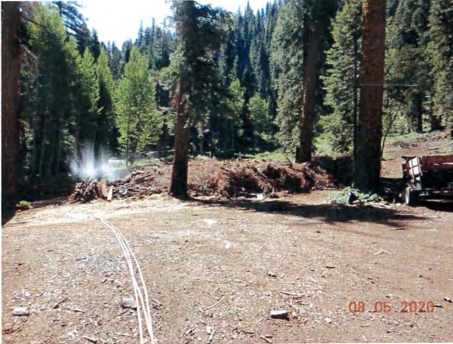
Photo 2. Recently cleared, partially stabilized open area with wood chips, slash pile, and small log deck.