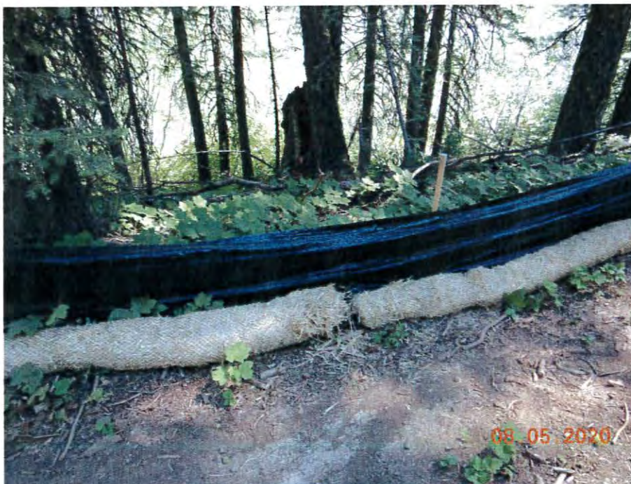
Photo 11. Downslope perimeter sediment control BMPs.