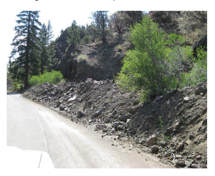
Accumulated debris along Wolf Creek Road piled in preparation for hauling

The Forest Service has prepared a BAER report that addresses forest visitor safety and water quality protection for the Washington fire area. Water Board staff reviewed the report, and visited the site on August 27, 2015. The fire resulted in a high risk to road infrastructure due to an increased threat of damage from flooding, debris flows, erosion and deposition. The Forest Service will protect water quality through construction of numerous surface stabilization and drainage improvements along existing Forest Service Roads (see map) that will reduce further erosion and water quality impacts associated with stormwater runoff. The treatments include armored low water ford crossings, rolling dips, detention basins, clear and armor culvert inlets, install larger culverts, and remove accumulated debris. The attached map shows areas of specific treatments prescribed for Forest Service roads within the burn area.