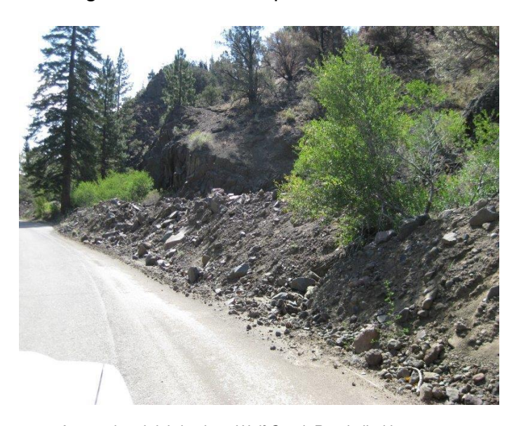
Accumulated debris along Wolf Creek Road piled in preparation for hauling

The Forest Service has prepared a BAER report that addresses forest visitor safety and water quality protection for the Washington fire area. Water Board staff reviewed the report, and visited the site on August 27, 2015. The fire resulted in a high risk to road infrastructure due to an increased threat of damage from flooding, debris flows, erosion and deposition. The Forest Service will protect water quality through construction of numerous surface stabilization and drainage improvements along existing Forest Service Roads (see map) that will reduce further erosion and water quality impacts associated with stormwater runoff. The treatments include armored low water ford crossings, rolling dips, detention basins, clear and armor culvert inlets, install larger culverts, and remove accumulated debris. The attached map shows areas of specific treatments prescribed for Forest Service roads within the burn area.