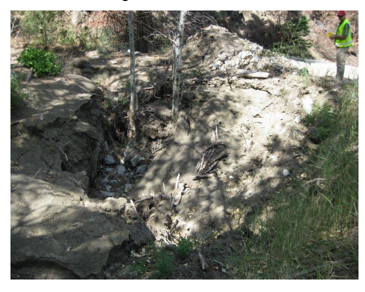
Culvert under Wolf Creek Road which was buried by the debris flow and subsequently caused flooding and erosion of the road bank and road shoulders

Caltrans has completed treatment along State Routes 4 and 89 that included removing debris, clearing culverts, and reestablishing road-side swales.