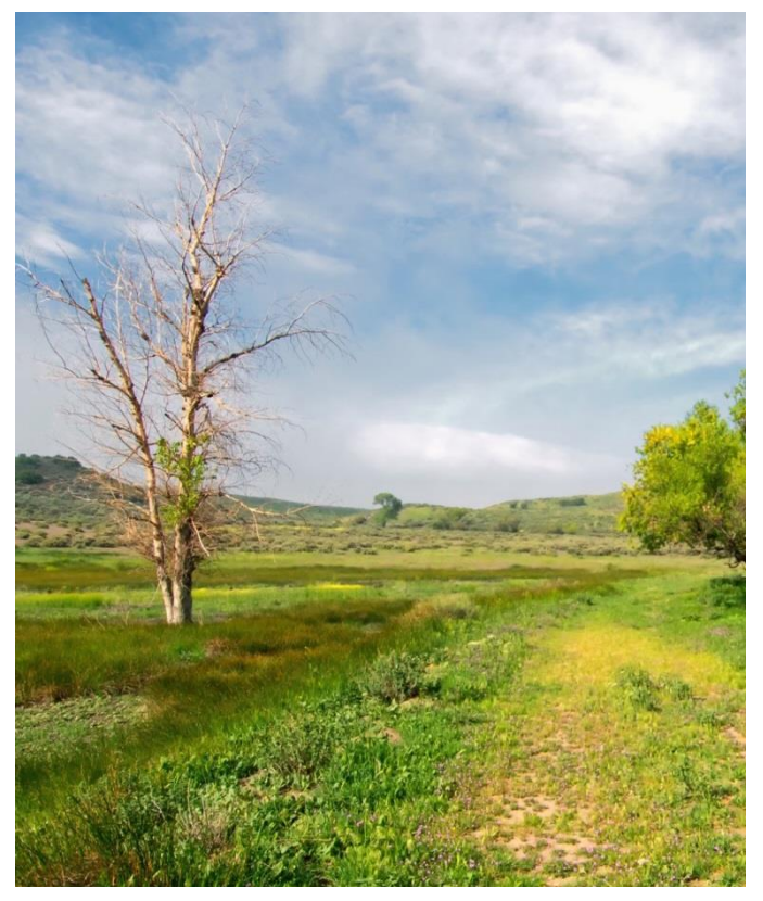
Seasonal wetlands and meadow habitats are among the many types of resources that will be preserved and enhanced within the Bank property.